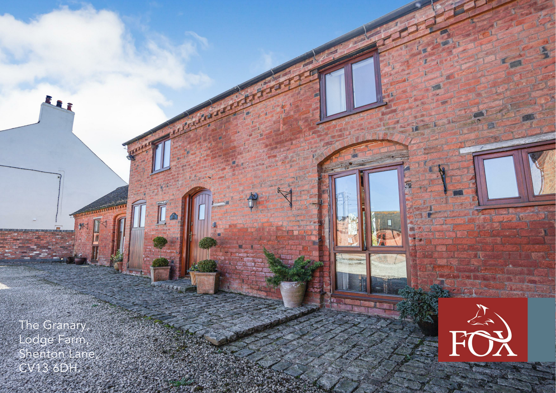
The Granary, Lodge Farm, Shenton Lane, CV13 6DH