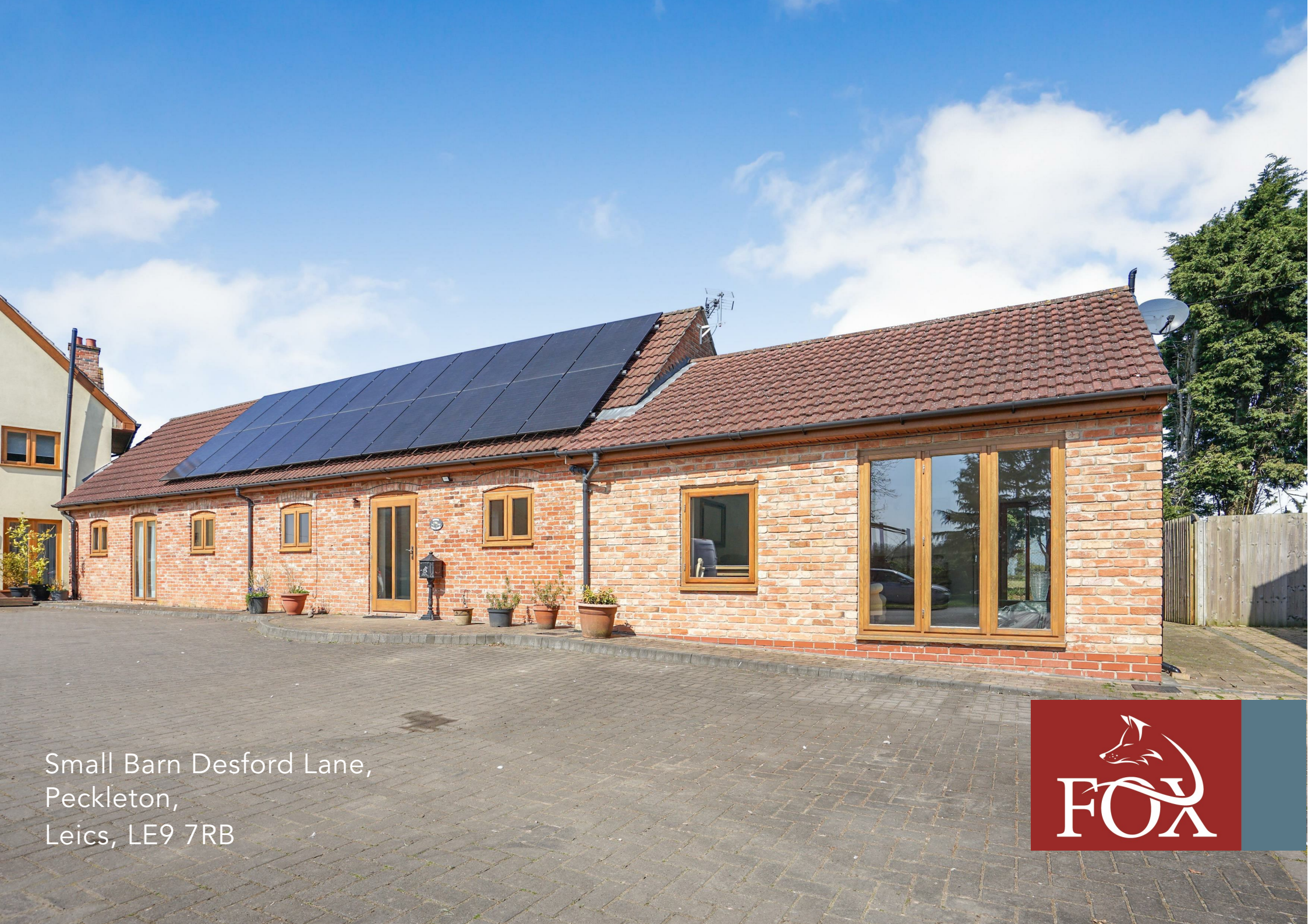
Small Barn Desford Lane, Peckleton, Leics, LE9 7RB