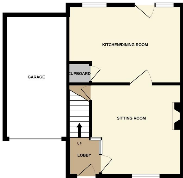
GROUND FLOOR 500 sq.ft. (46.4 sq.m.) approx.