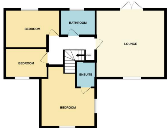
TOTAL FLOOR AREA : 1370 sq.ft. (127.3 sq.m.) approx.

Whilst every attempt has been made to ensure the accuracy of the floorplan contained here, measurements of doors, windows, rooms and any other items are approximate and no responsibility is taken for any error, omission or mis-statement. This plan is for illustrative purposes only and should be used as such by any prospective purchaser. The services, systems and appliances shown have not been tested and no guarantee as to their operability or efficiency can be given. Made with Metropix ©2024