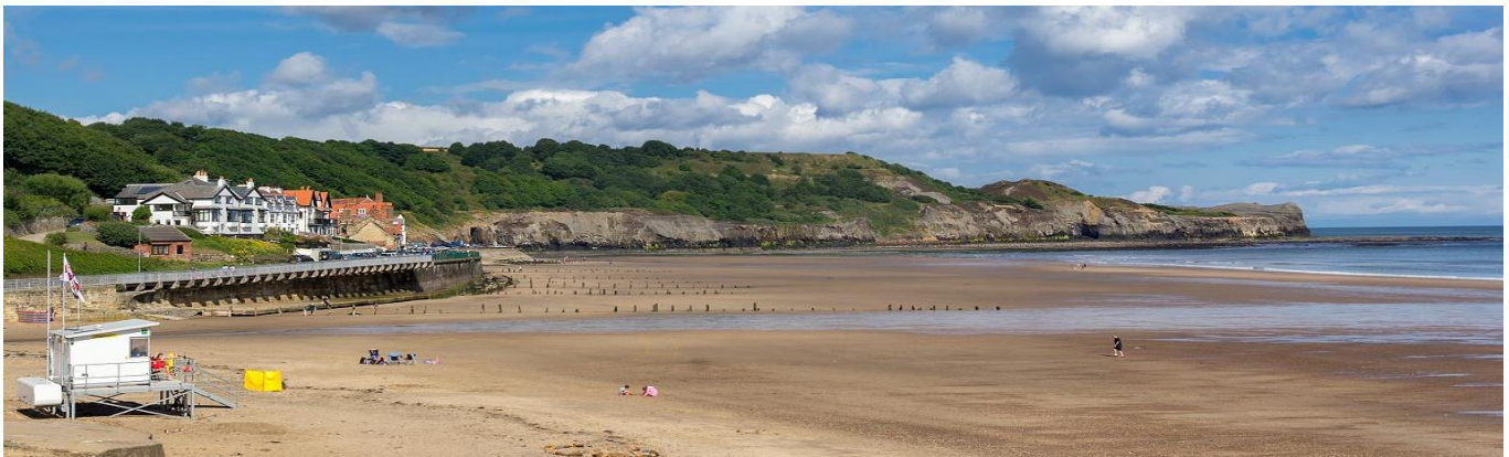
Sandsend: One of the most popular coastal villages near Whitby.