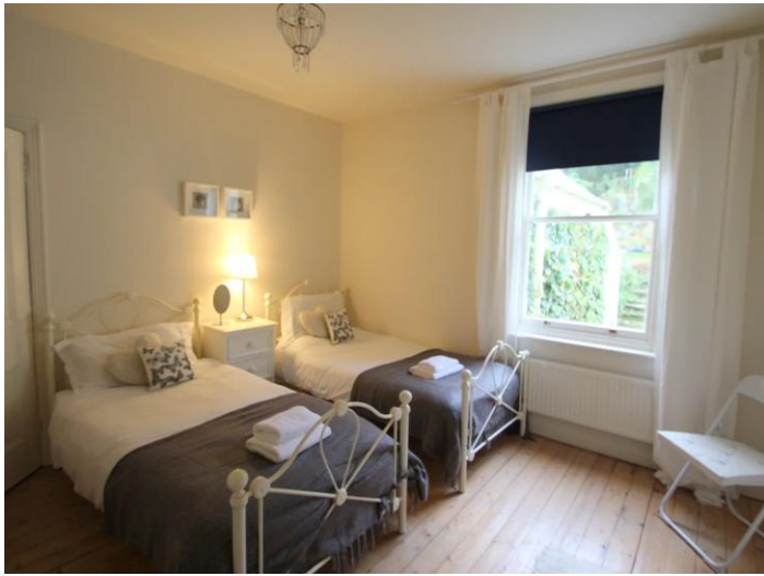
Twin Bedroom: A double room with two single beds and a wash basin.