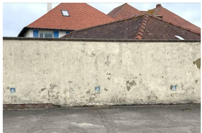
Numbered Parking Space

Richardson and Smith have prepared these particulars in good faith to give a fair overall view of the property based on their inspection and information provided by the landlord(s). The particulars are a general outline only for the guidance of intending tenants and do not constitute an offer or contract. Any prospective tenants should satisfy themselves by inspection or otherwise as to their correctness.