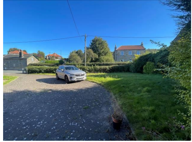
Driveway & Garden