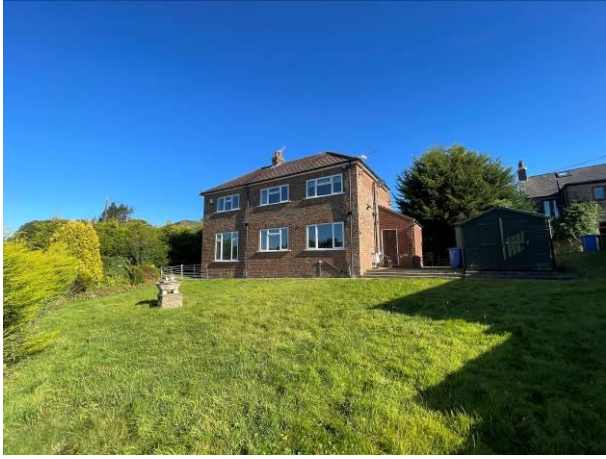
Front & Garden