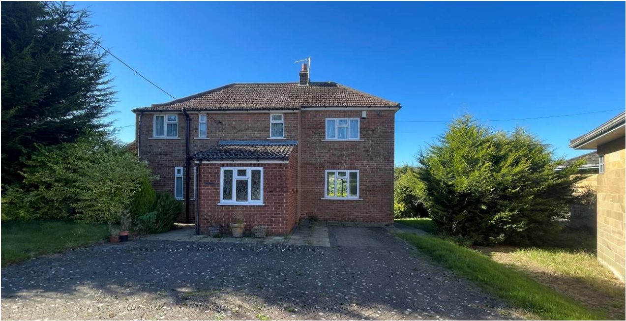
Rear & Driveway

Lying adjacent to the village Catholic Church. The Priory is a detached brick former presbytery. There are 2 double bedrooms and a small single, plus a semi-ensuite bathroom upstairs. Downstairs, there are front and side porches, a WC, 2 good reception rooms and a fitted kitchen. Outside there are large gardens to front and rear, a wide parking driveway and 2 useful sheds