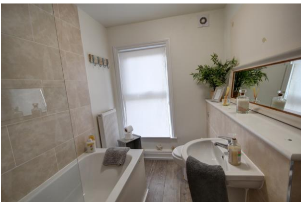
Bathroom: Having a modern white suite comprising panelled bath with electric shower over and screen, hand basin and w.c. There is half tiling to the walls, window to the rear and a radiator.