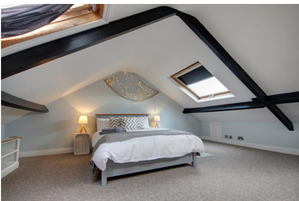
Attic Bedroom: Having Velux windows to front and rear which enjoy views over to the Abbey and across the town to the harbour mouth and the sea, and radiator.