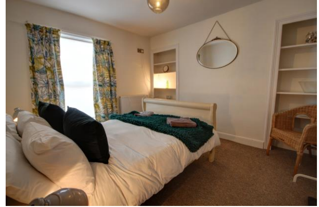
Double Bedroom: To the front, with radiator and shelved alcoves.