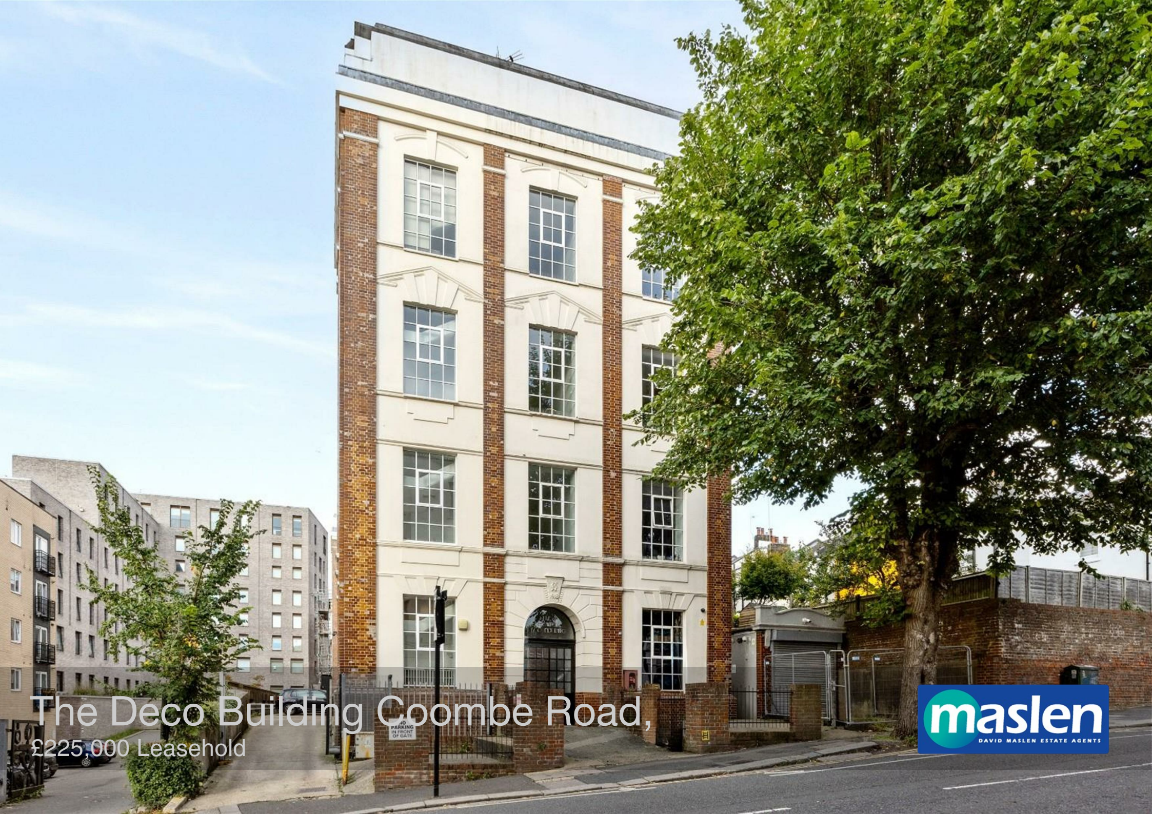
The Deco Building Coombe Road, £225,000 Leasehold