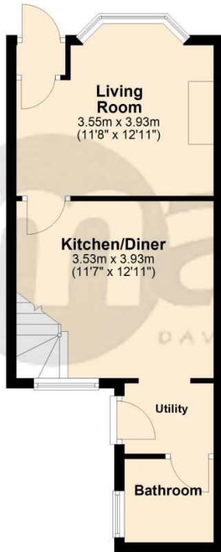
Ground Floor Approx. 32.1 sq. metres (345.3 sq. feet)