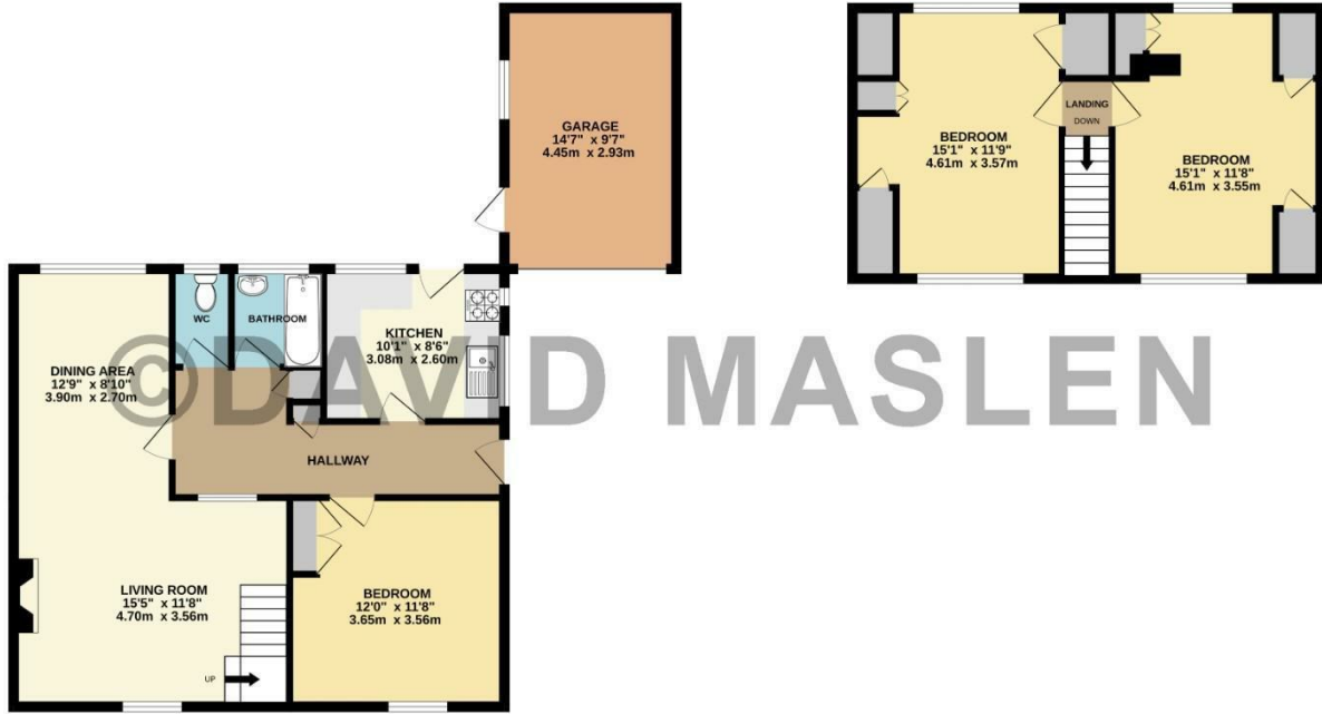
TOTAL FLOOR AREA : 1199 sq.ft. (111.4 sq.m.) approx.

Whilst every attempt has been made to ensure the accuracy of the floorplan contained here, measurements of doors, windows, rooms and any other items are approximate and no responsibility is taken for any error, omission or mis-statement. This plan is for illustrative purposes only and should be used as such by any prospective purchaser. The services, systems and appliances shown have not been tested and no guarantee as to their operability or efficiency can be given. Made with Metropix ©2024