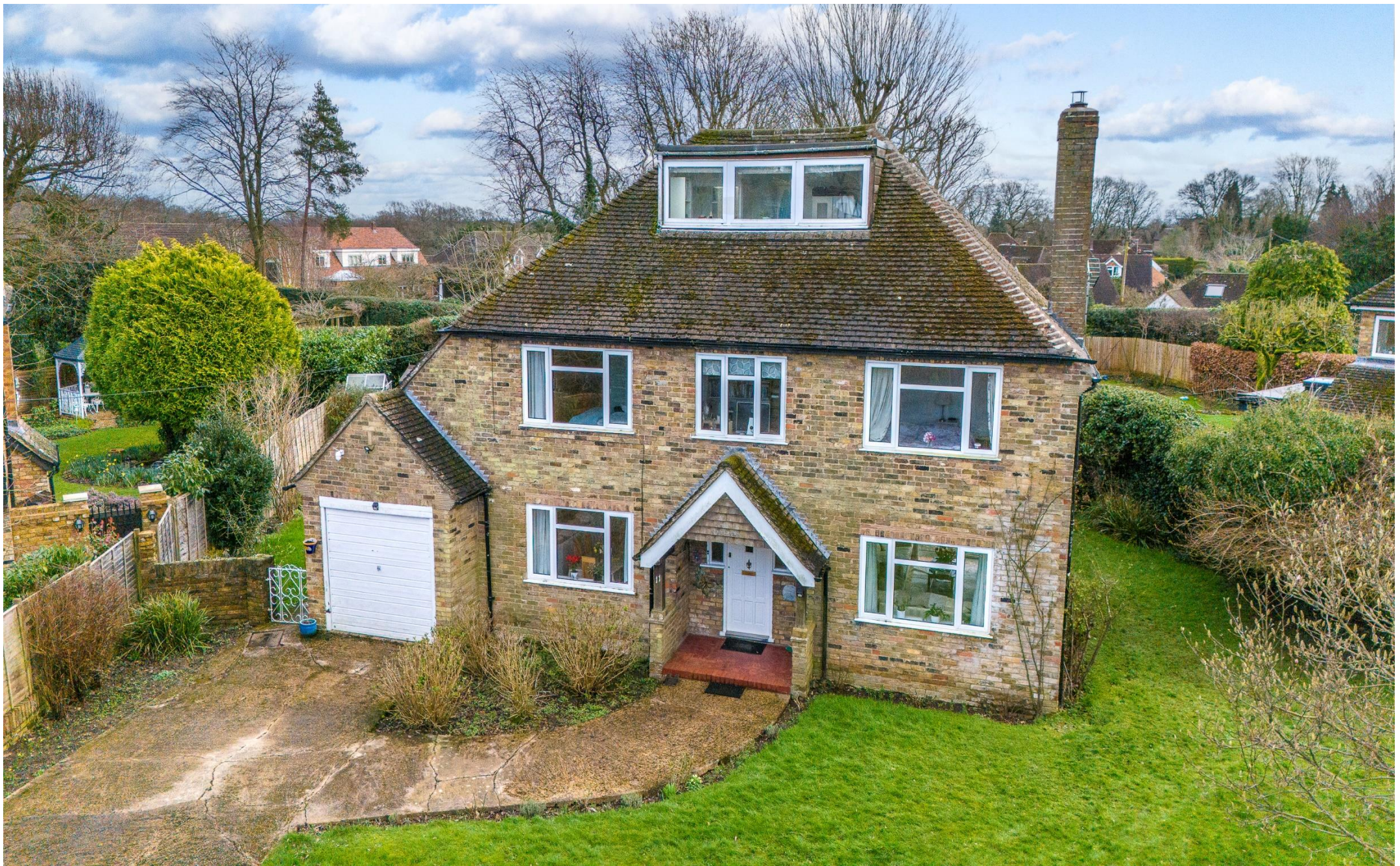
11 Green Park Prestwood