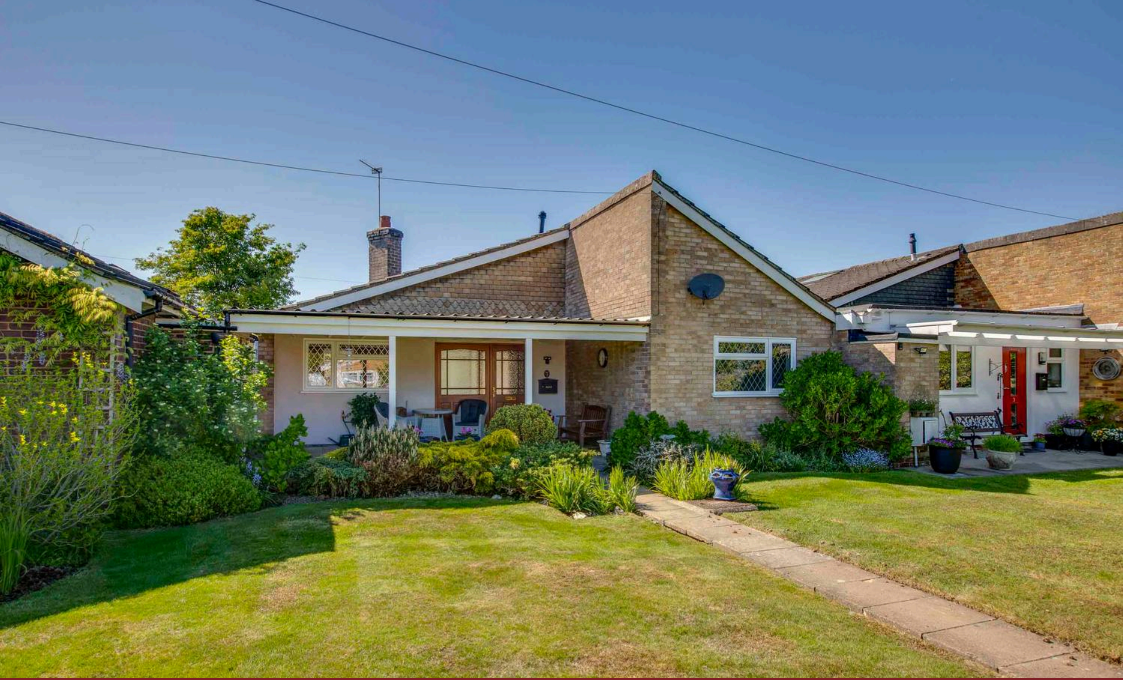
2 Darvills Meadow, Holmer Green - HP15 6ST Guide £550,000