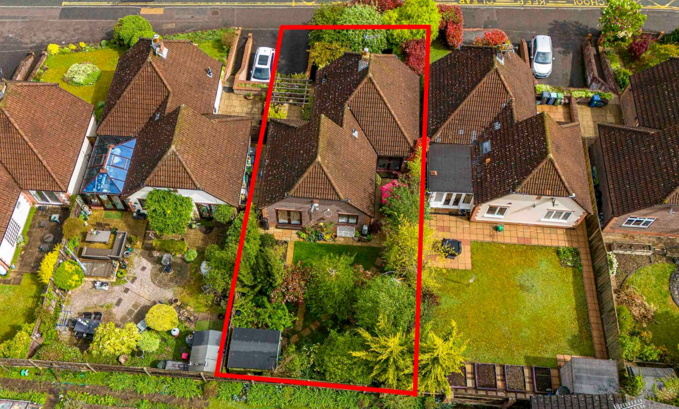
6 Hardymead Court, 204 Kingsmead Road, High Wycombe - HP11 1JS £585,000