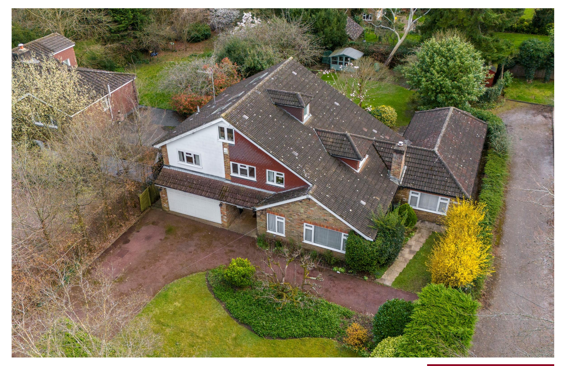
Allyn House, Terry Road High Wycombe