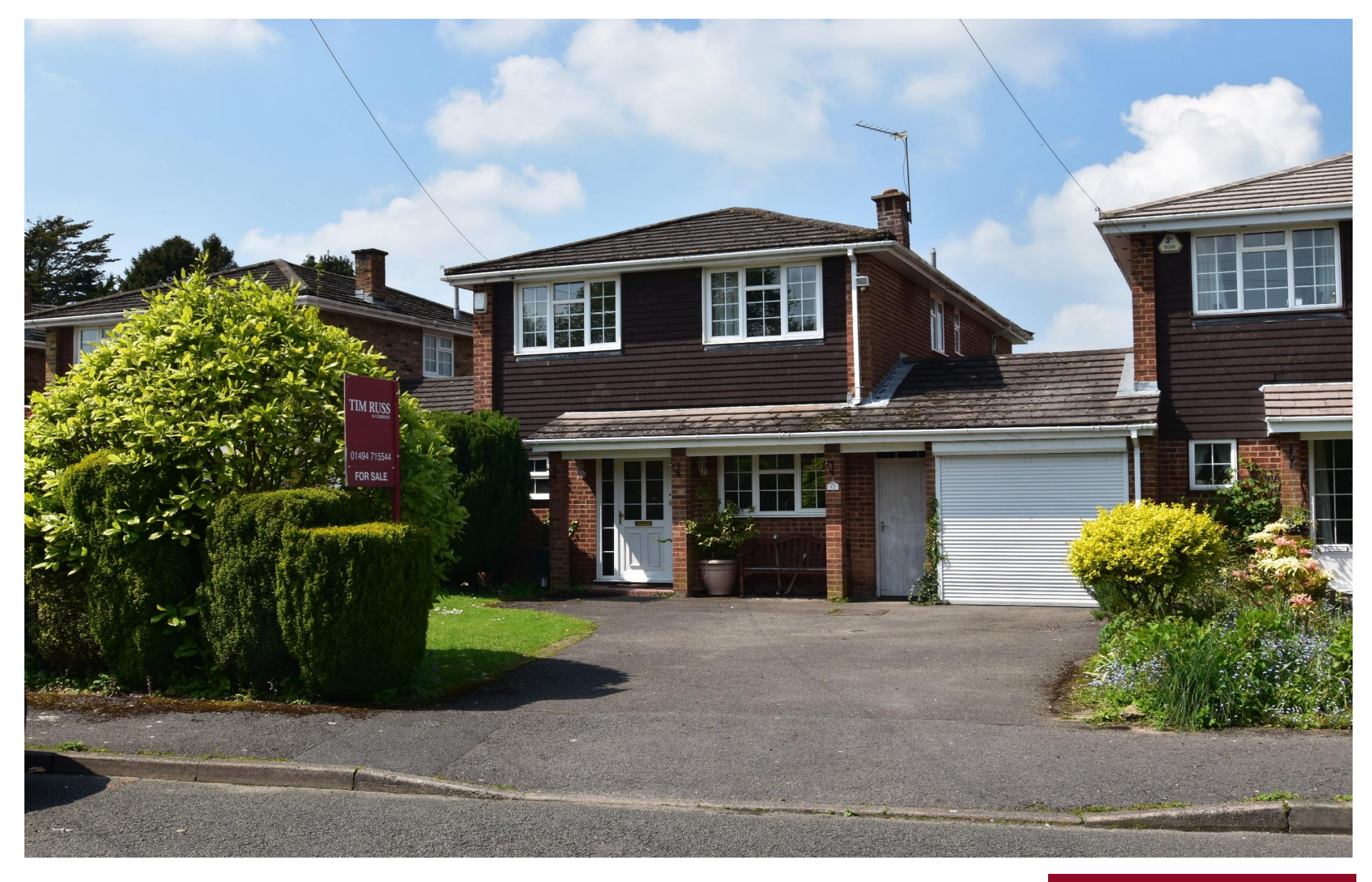
12 The Rosary Holmer Green