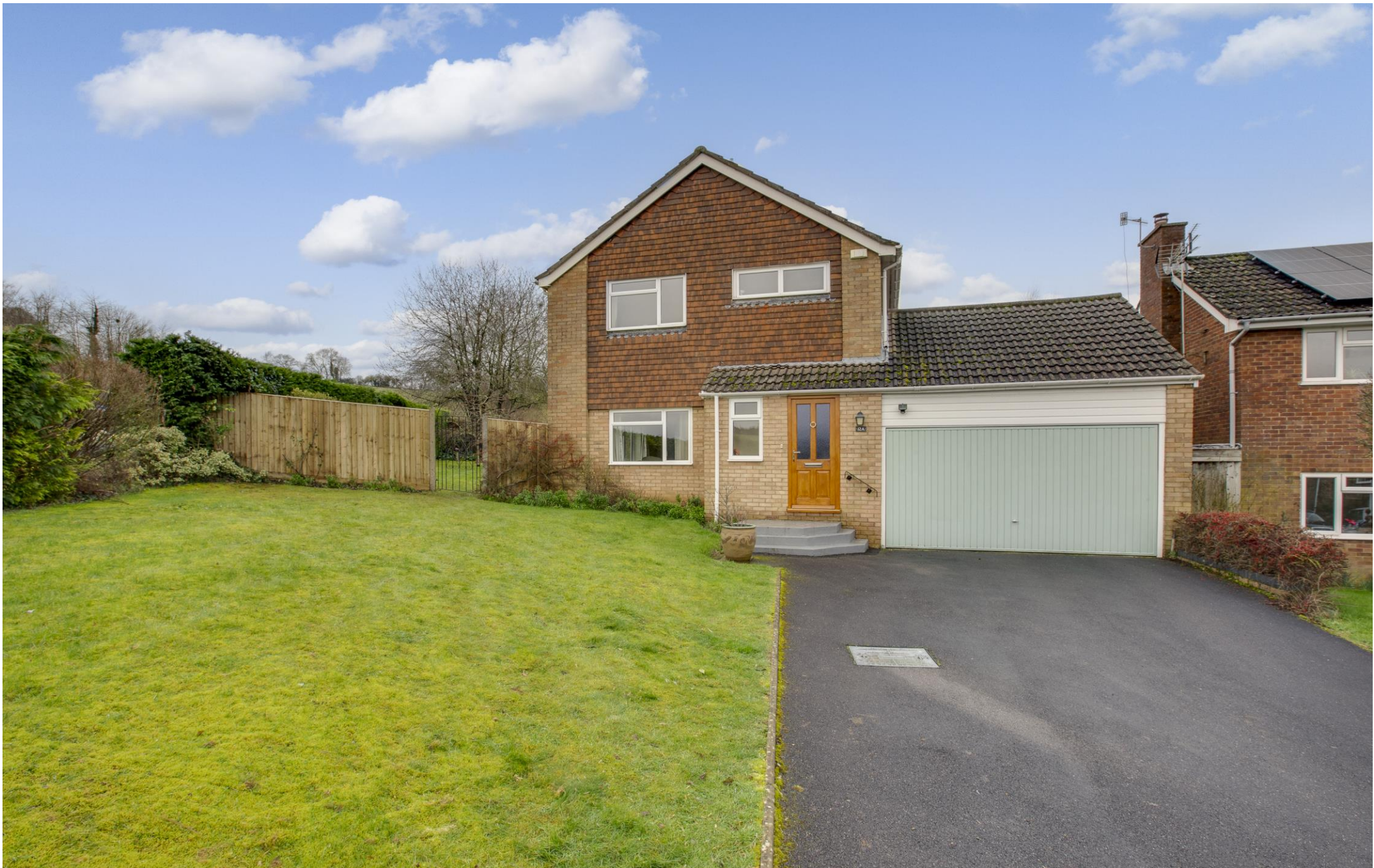
12a Whitfield Road Hughenden Valley