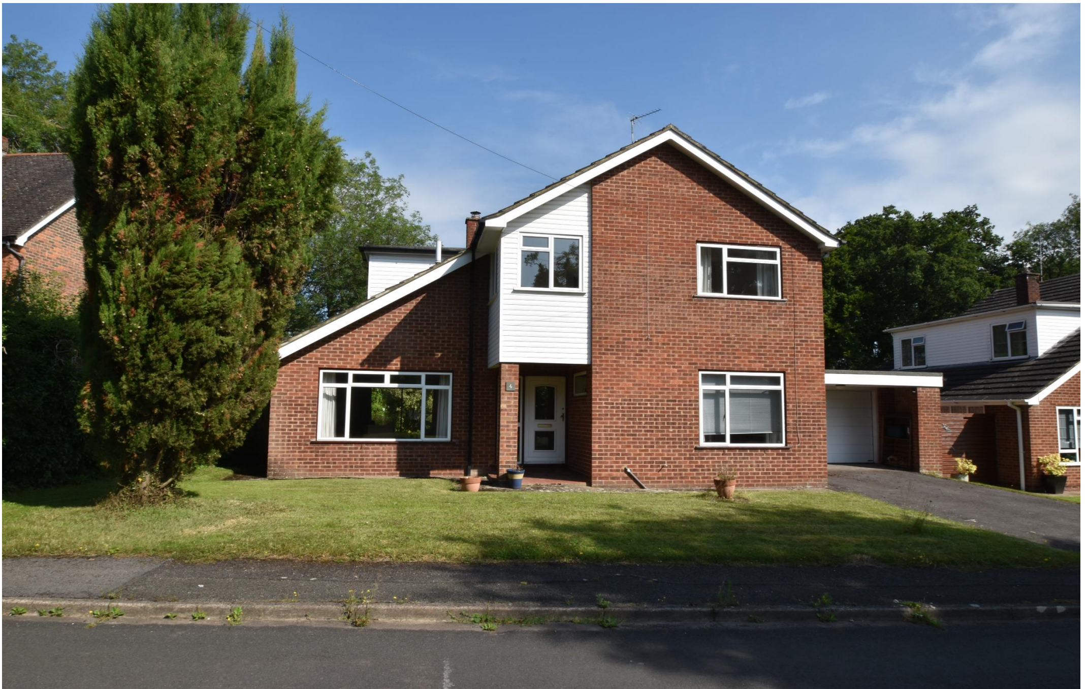
4 Willow Chase Hazlemere