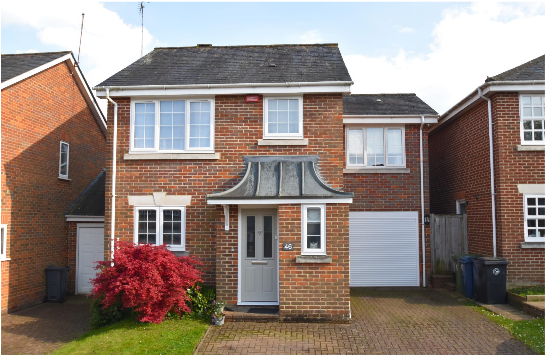
46 Kite Wood Road Penn