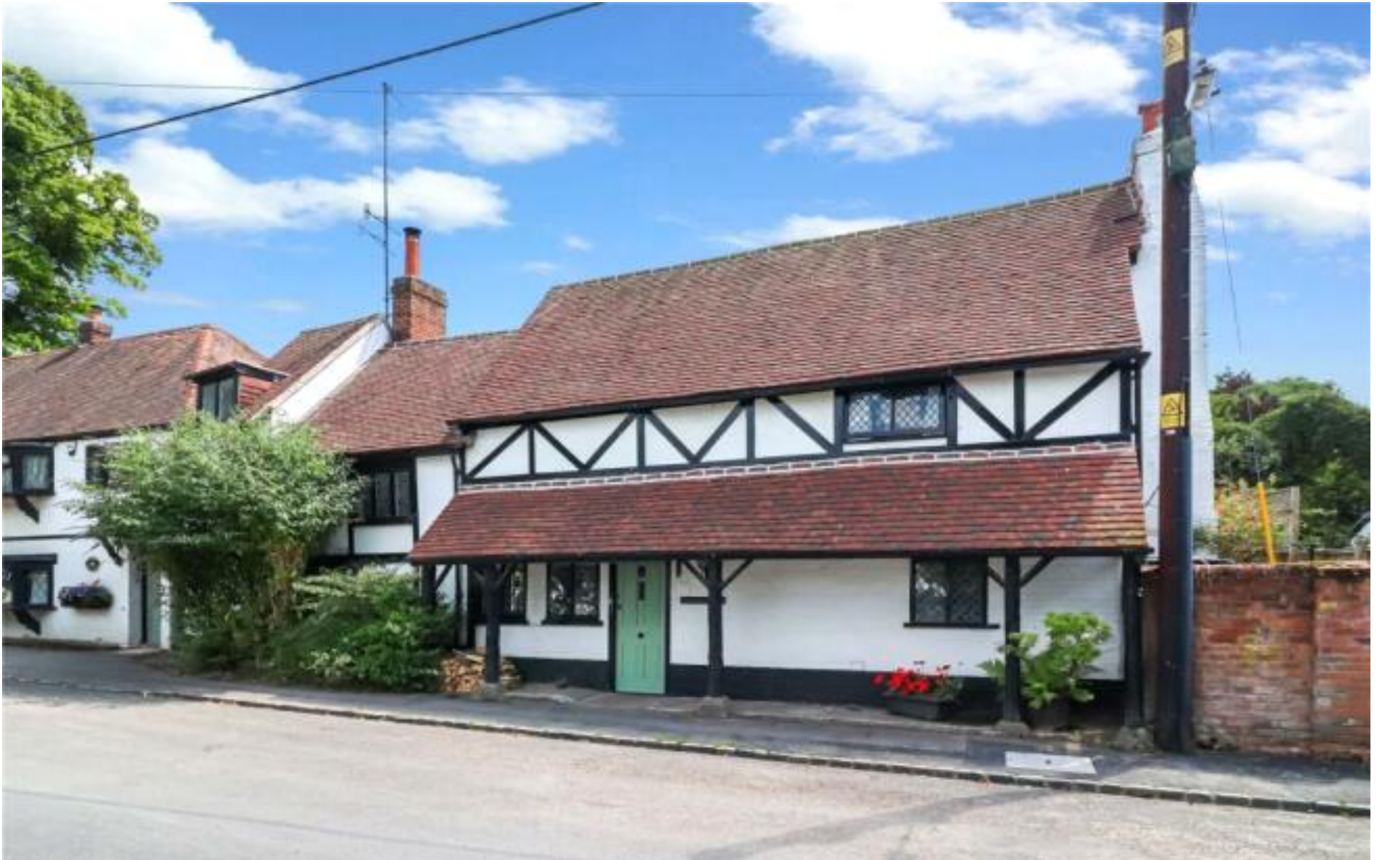
Wooburn Town Buckinghamshire