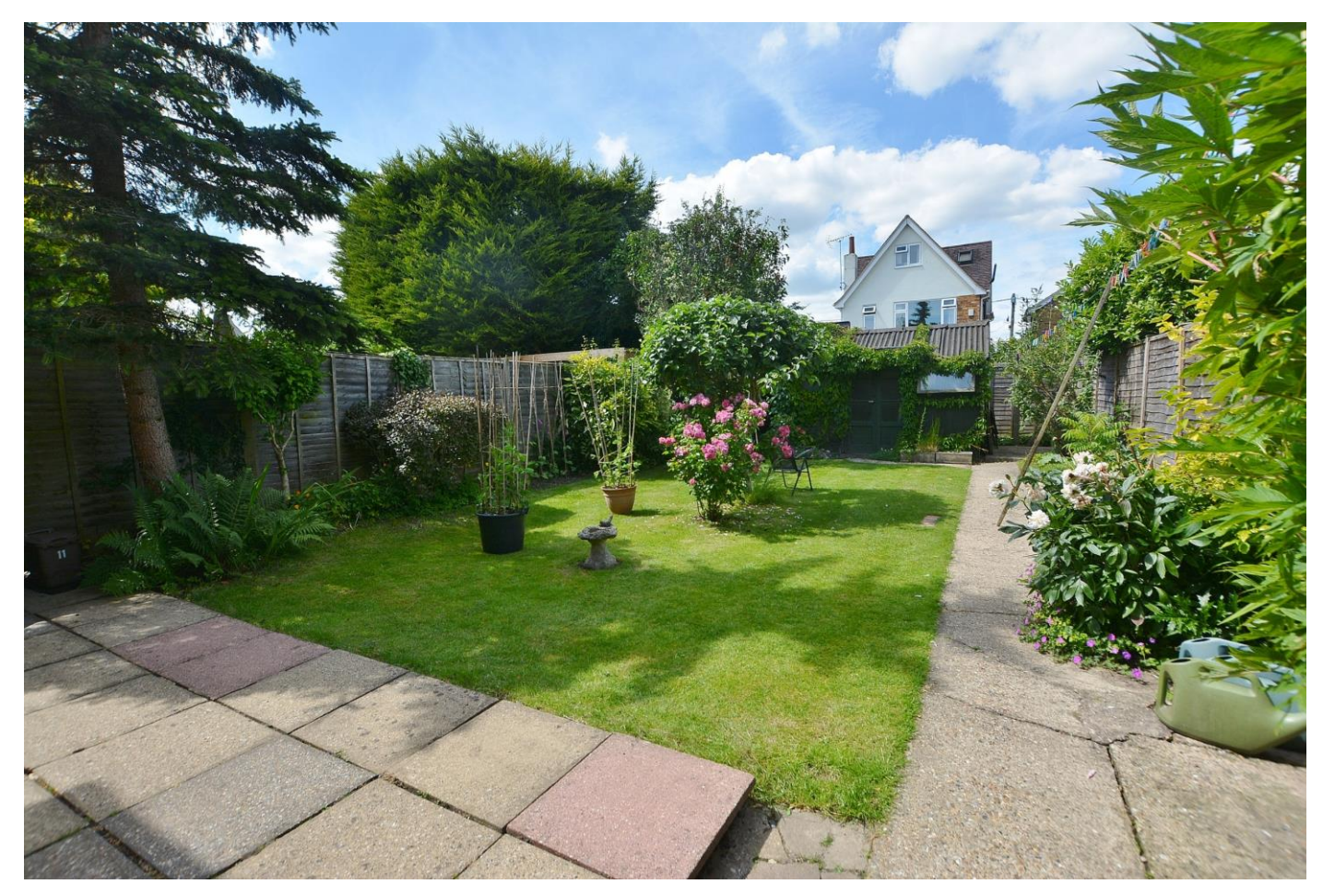
11 Holland Road Marlow Buckinghamshire SL7 1LH

An individual detached three-bedroom house in tucked away position in no through road – no chain above