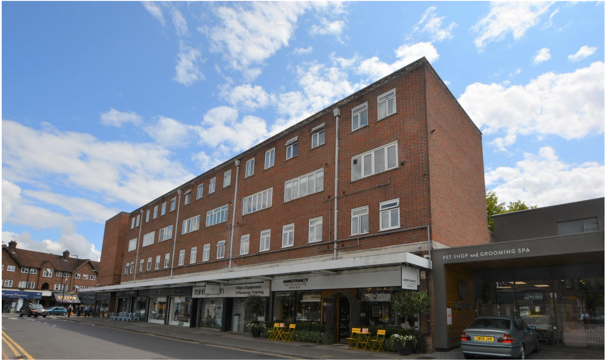
Cardain House, Burkes Road Beaconsfield, Buckinghamshire