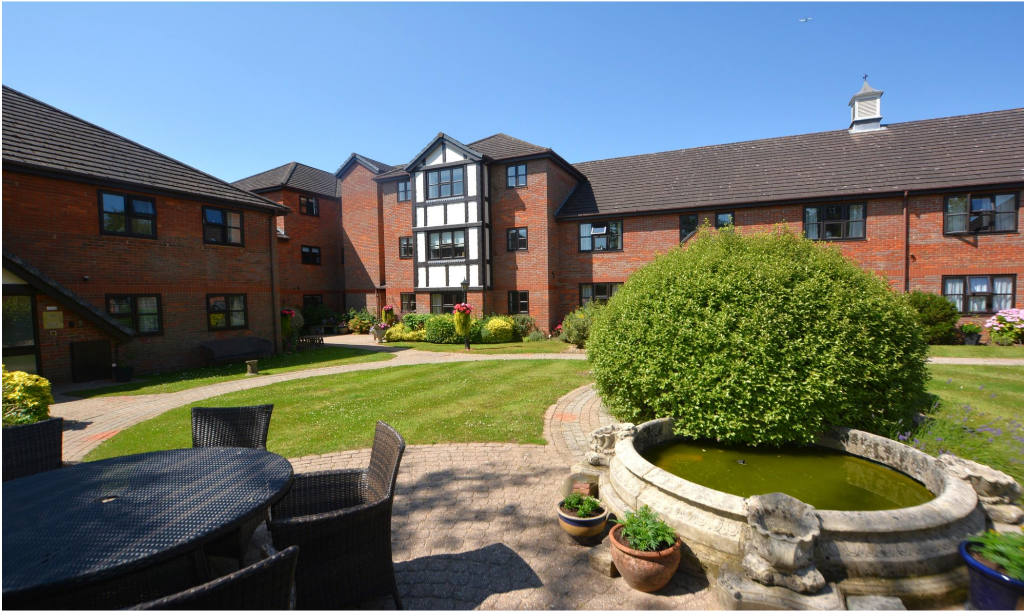
The Hollies, Beaconsfield Buckinghamshire