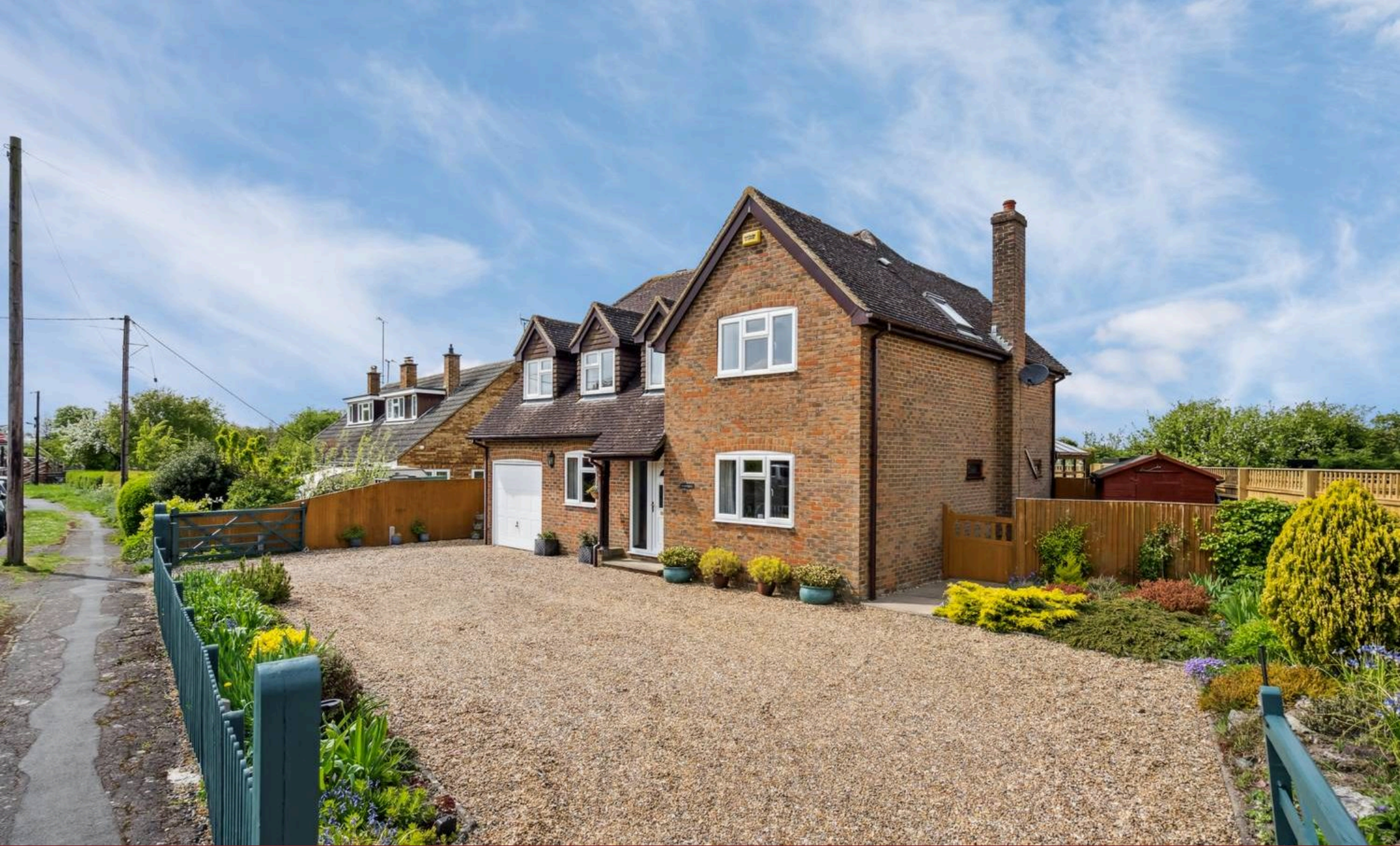
Crowbrook Road, Monks Risborough £875,000