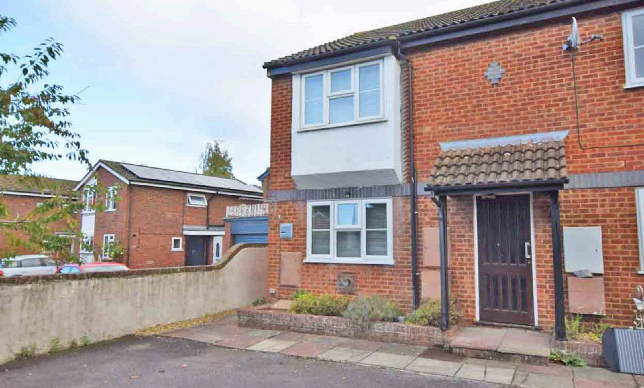
Staddle Stones New Road, Princes Risborough - HP27 0JJ £200,000