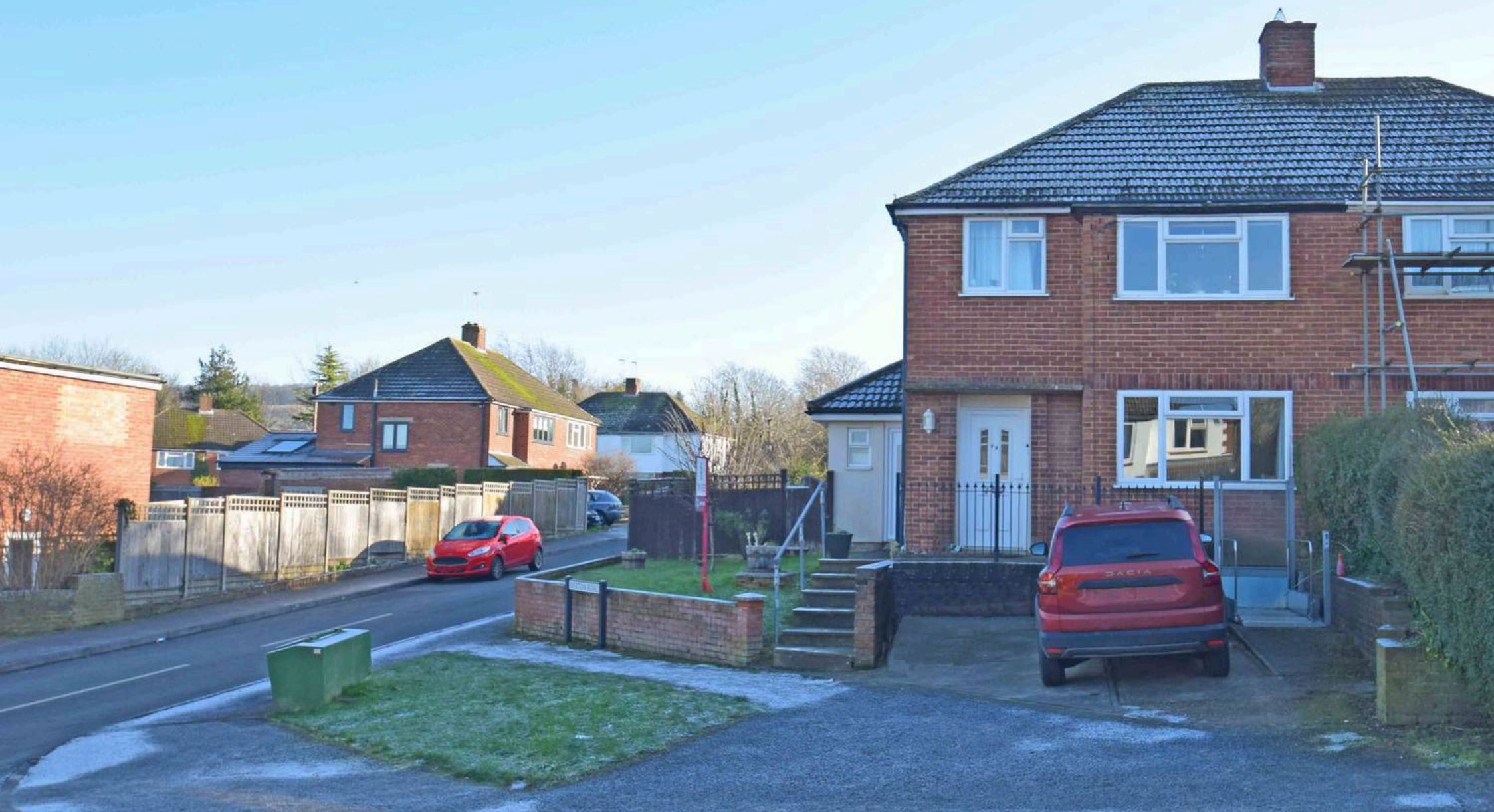
Clifford Road, Princes Risborough - HP27 0DP £500,000