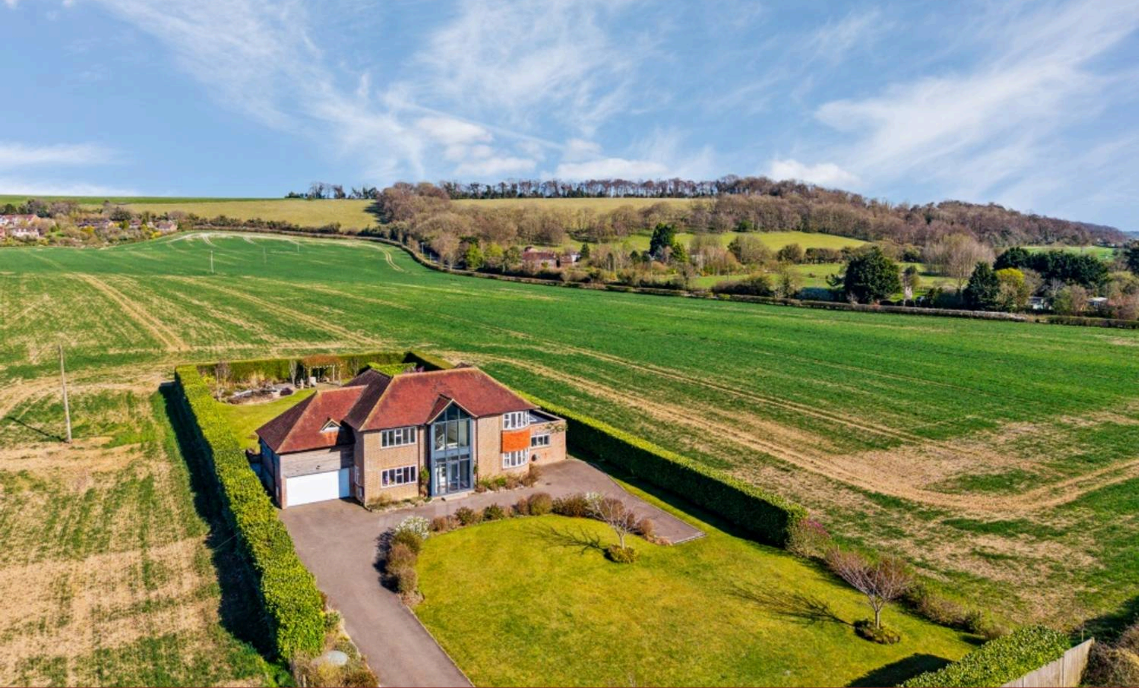
Rutherglen Wycombe Road, Saunderton £1,595,000