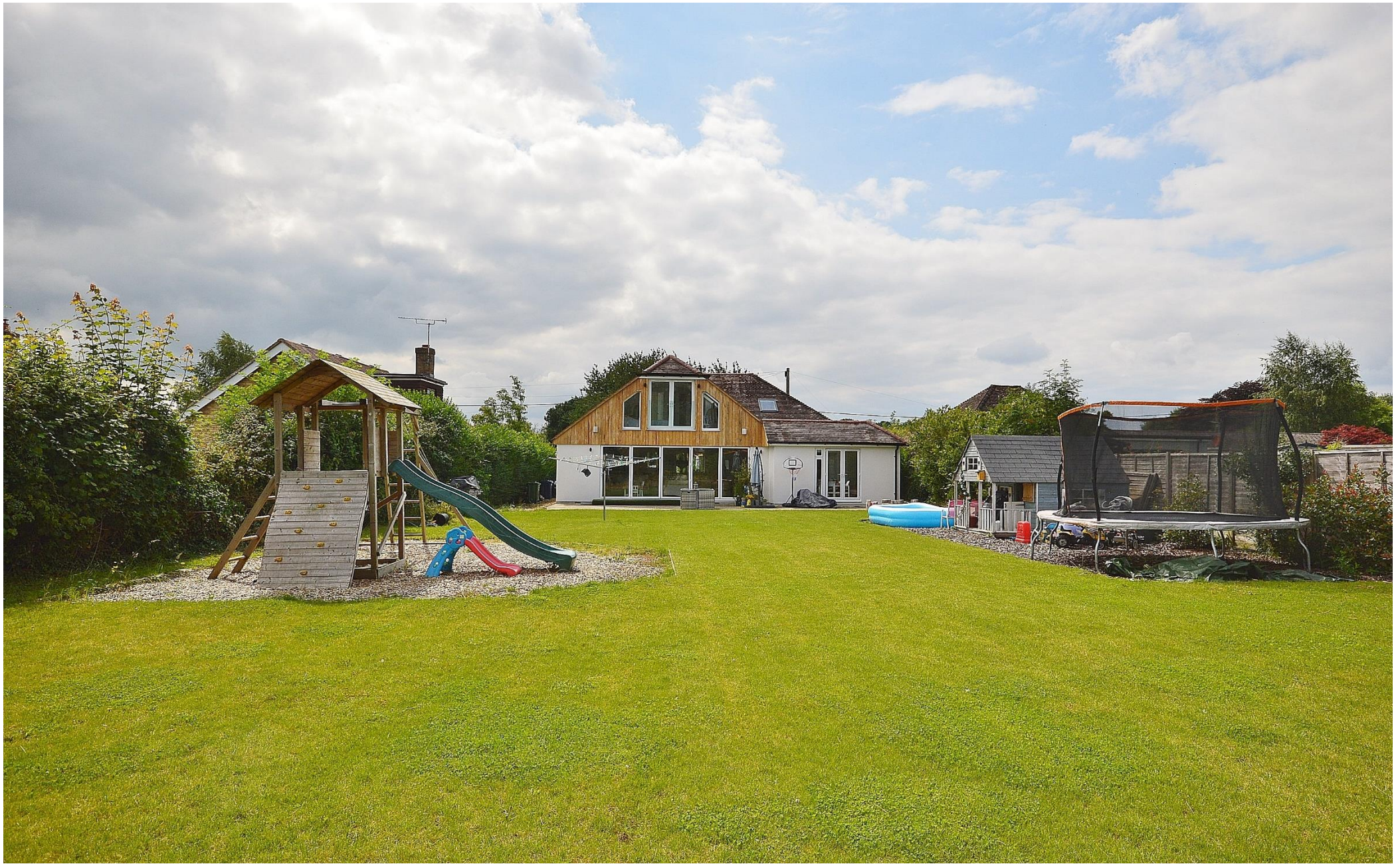
Green Lane Radnage