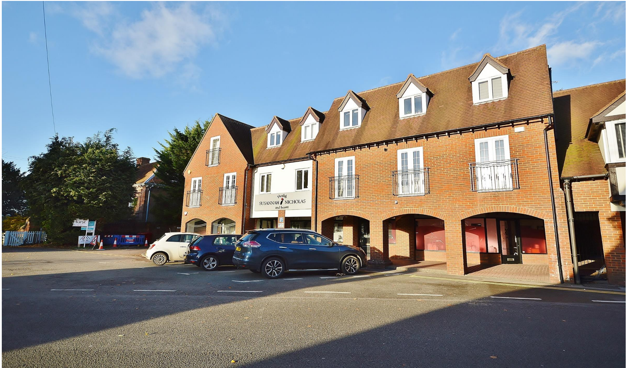
The Malthouse Princes Risborough