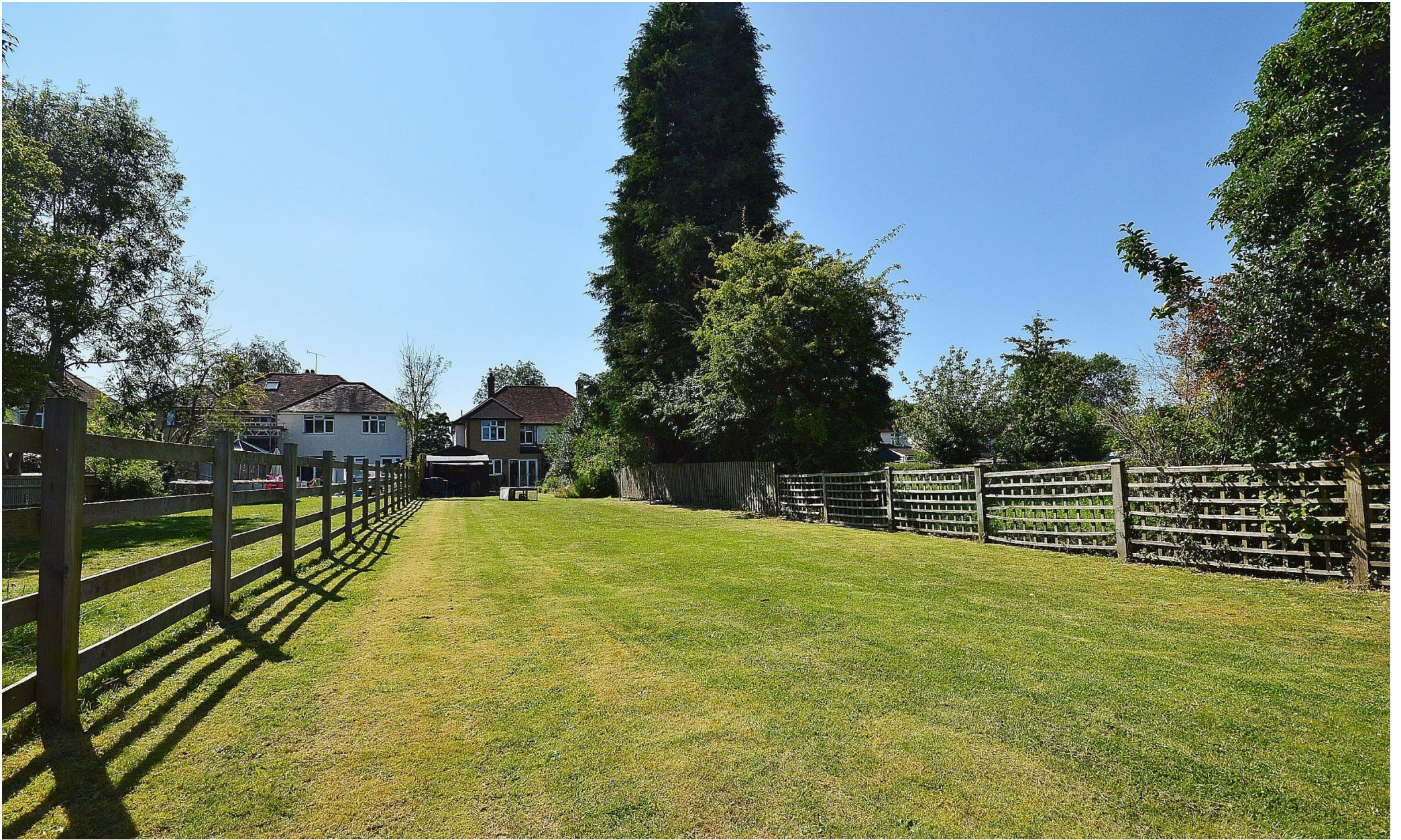
Summerleys Road Princes Risborough