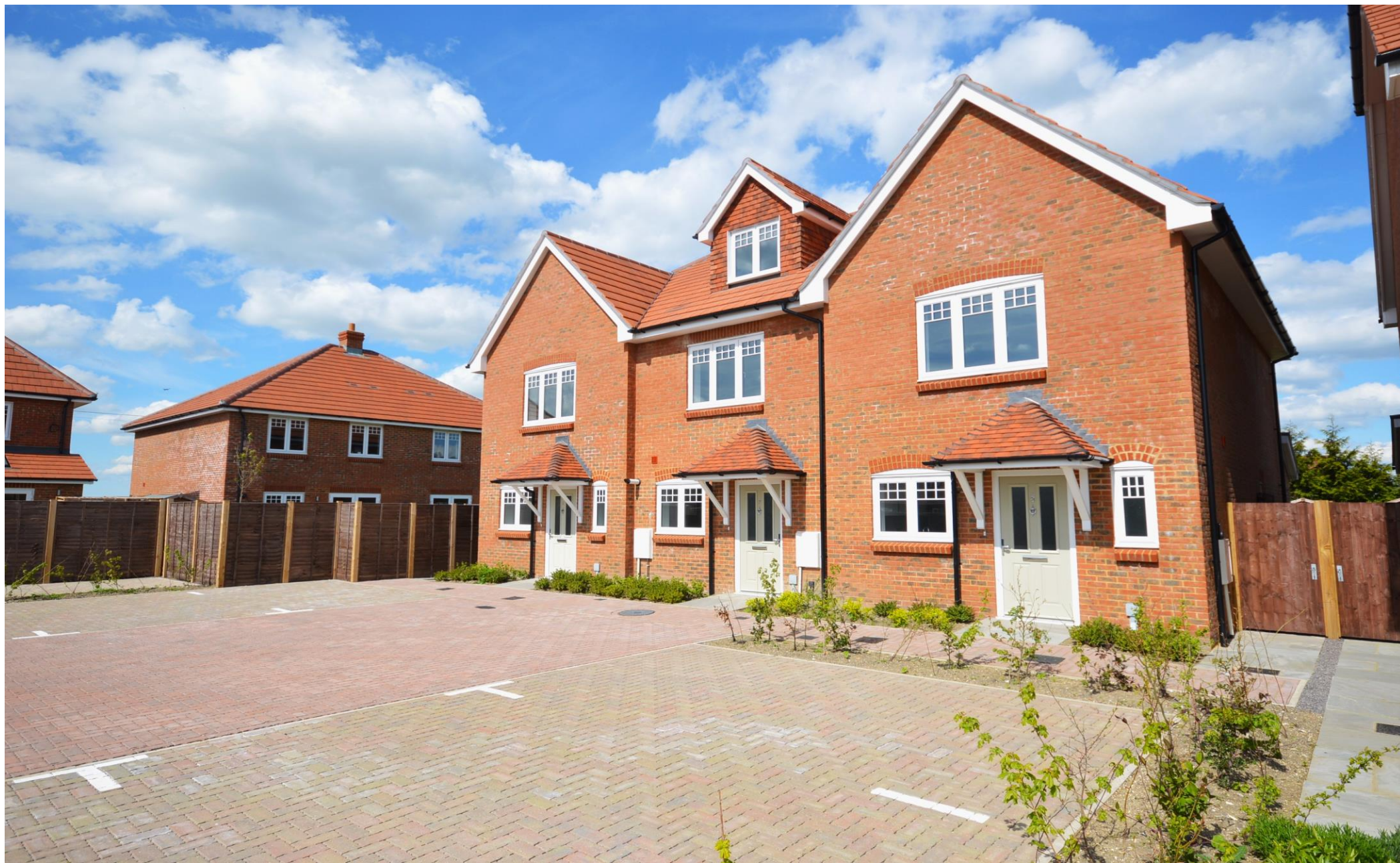
Plot 7, Pippin Place, Grove Lane, Great Kimble