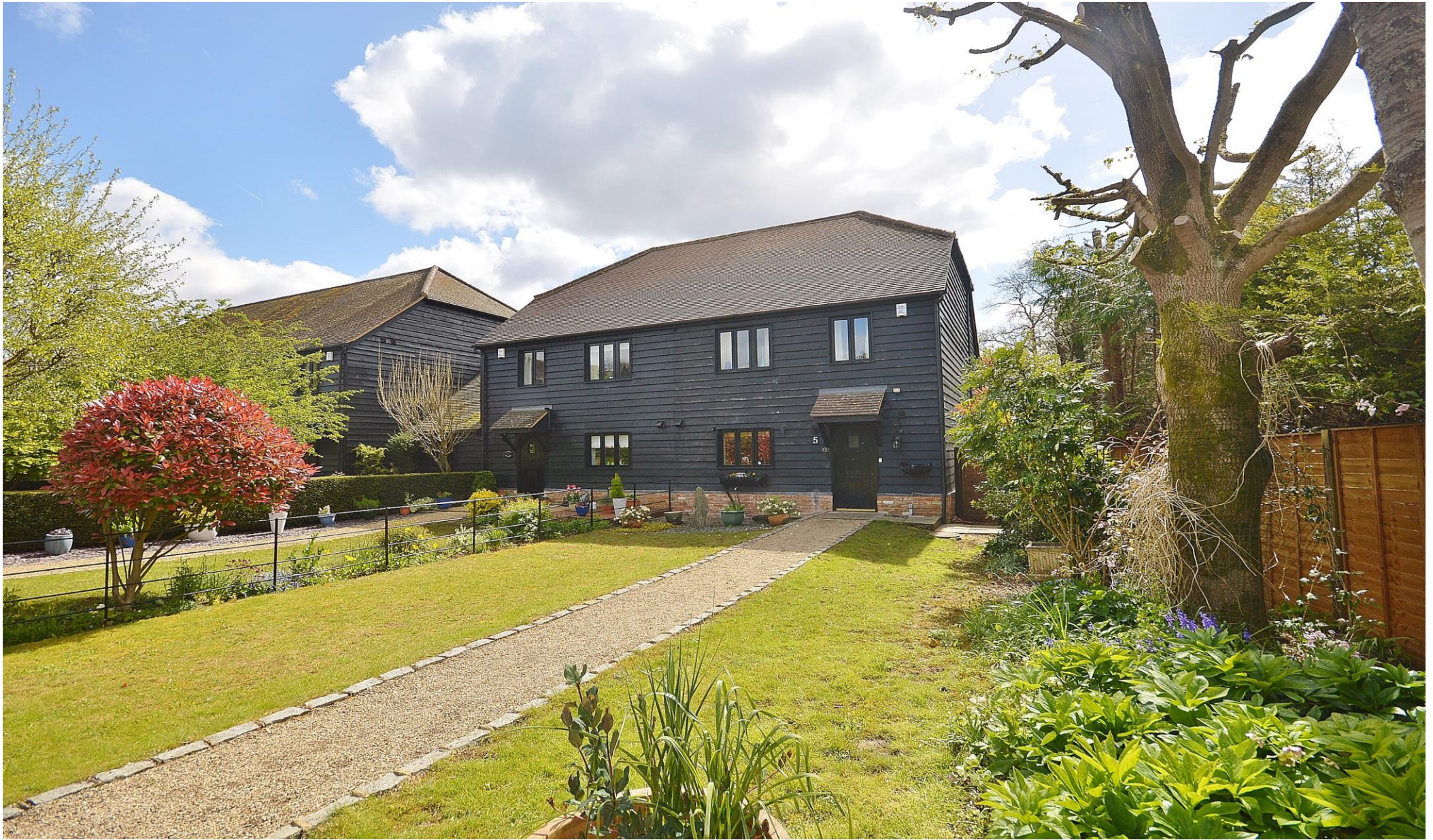
The Cottages Longwick