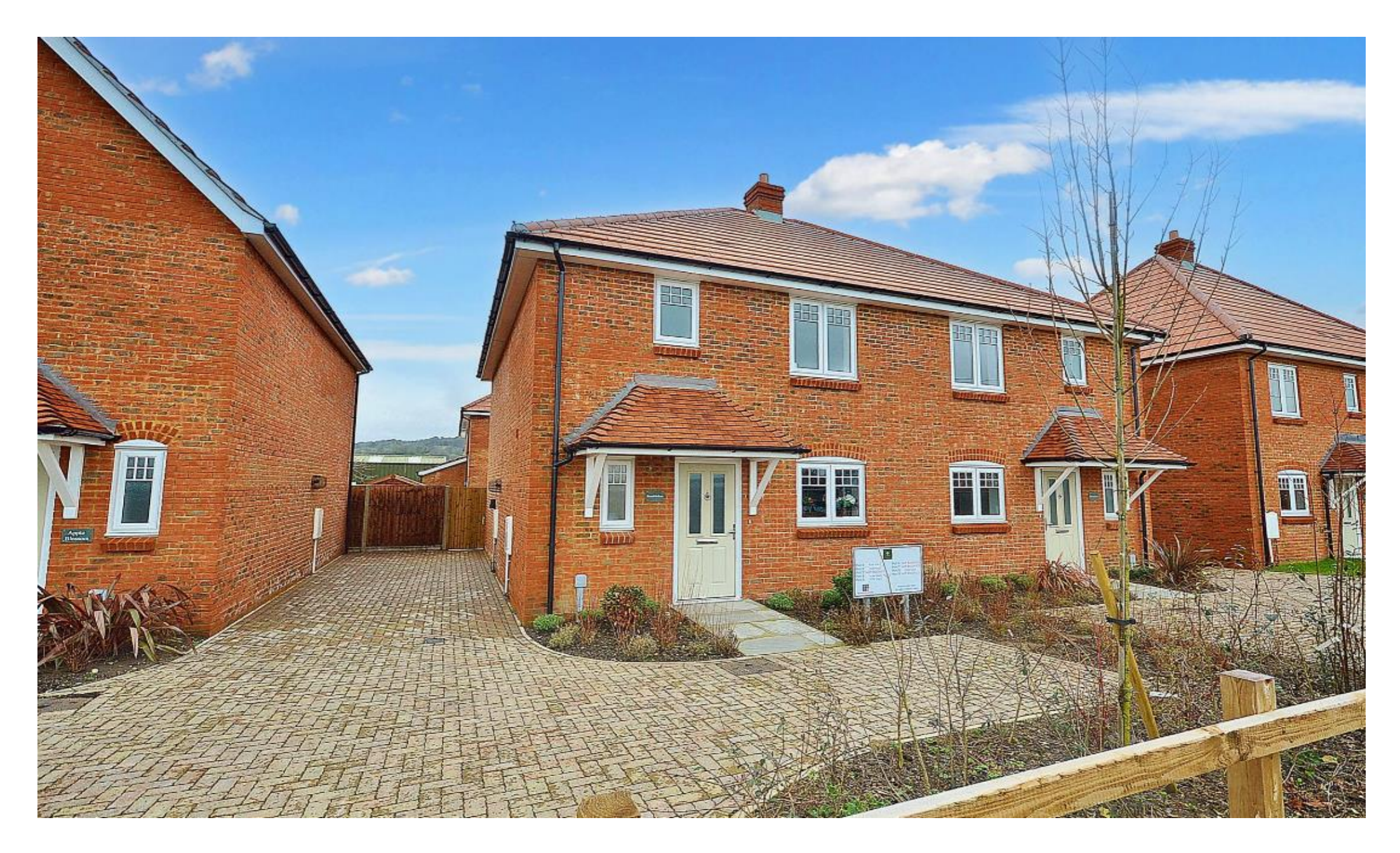
Plot 2, Pippin Place Grove Lane, Great Kimble