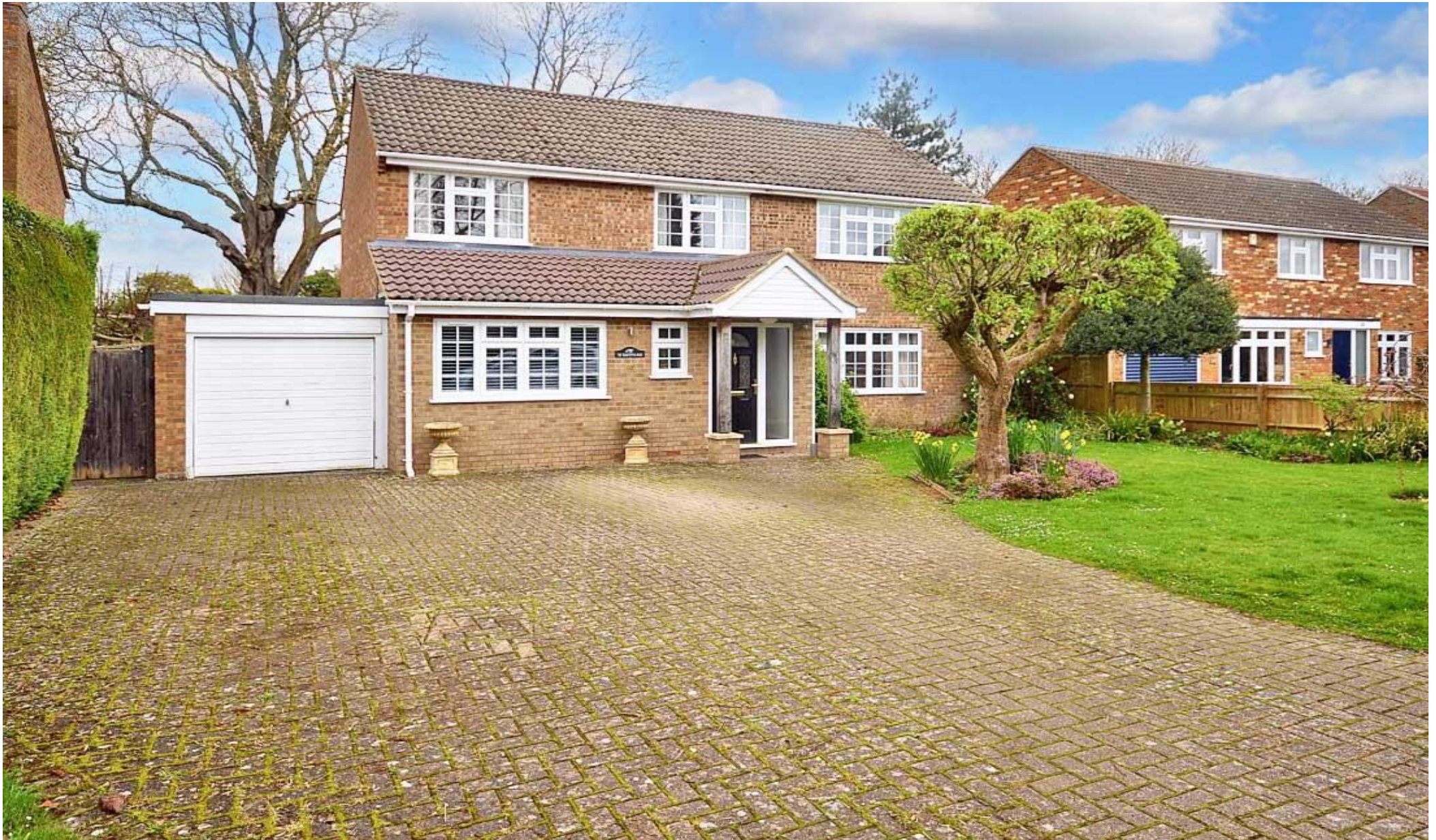
Bell Crescent Longwick