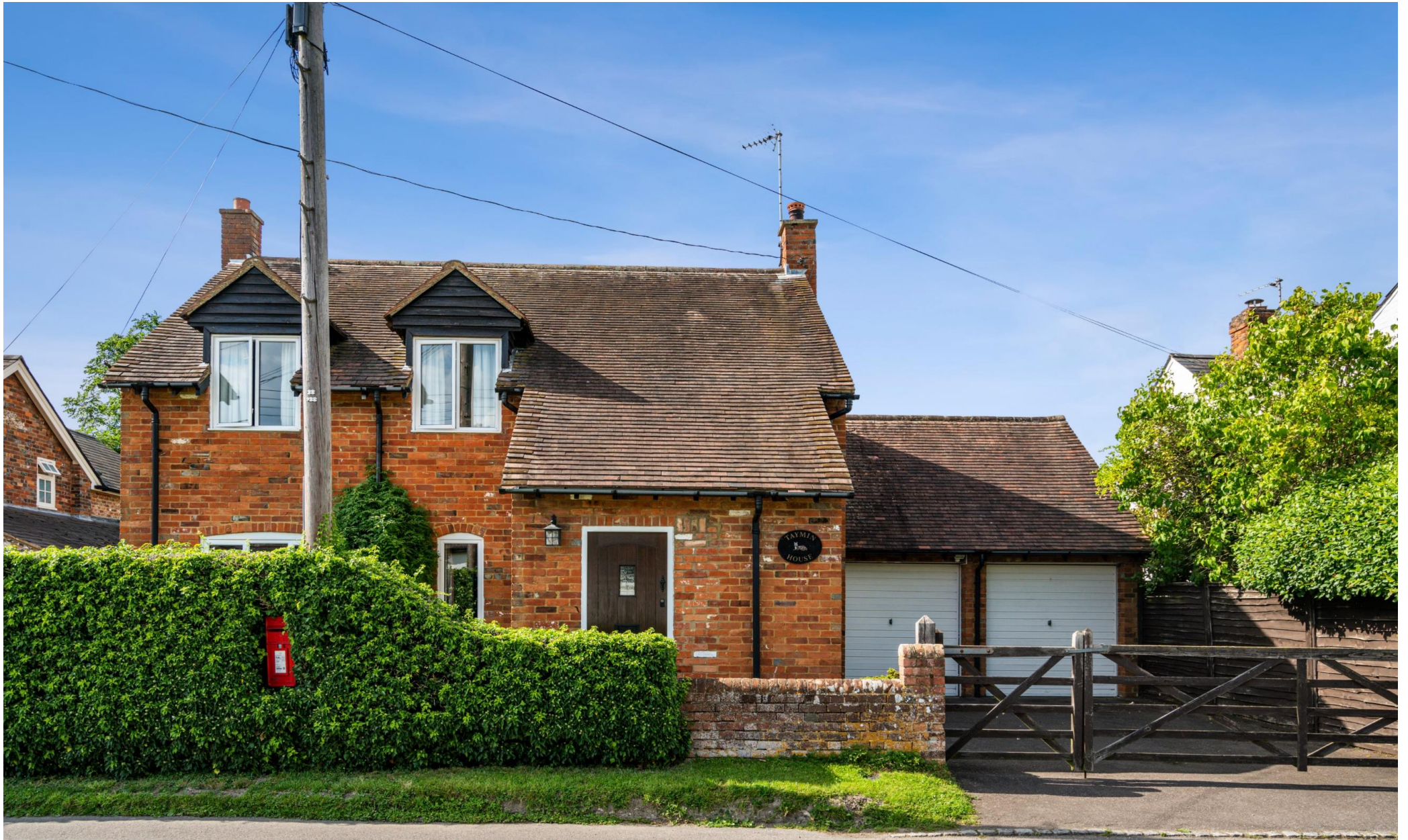
Crowbrook Road Askett