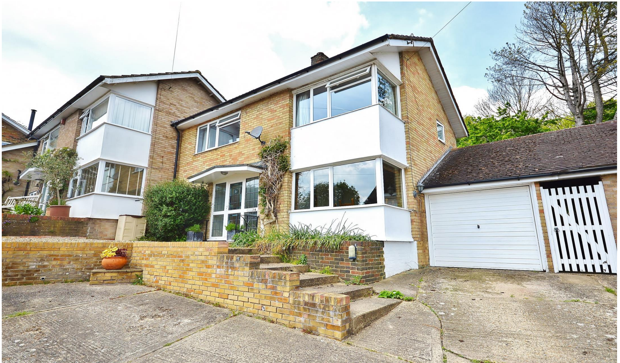
Ridge Side Bledlow Ridge