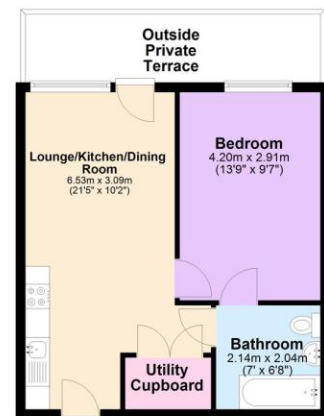
Ground Floor Approx. 39.6 sq. metres (426.2 sq. feet)

Total area: approx. 39.6 sq. metres (426.2 sq. feet)