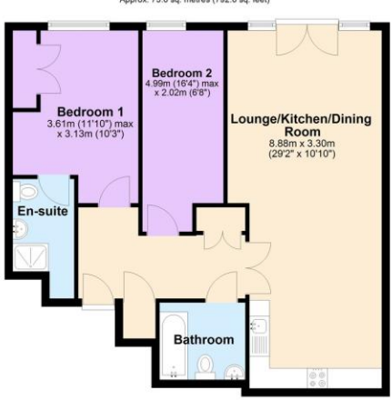
Total area: approx. 73.6 sq. metres (792.6 sq. feet)