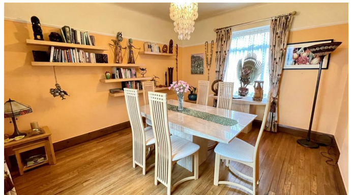
DOUBLE ASPECT DINING ROOM 13'8" x 11'7" (4.18m x 3.55m)

Picture rails, wood block flooring, upvc double glazed windows.