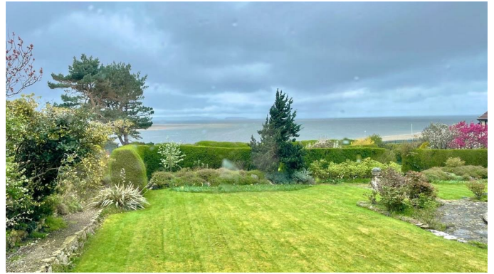
VIEW FROM LOUNGE

N.B. The garden seen here belongs to the house next door and is not part of the property.