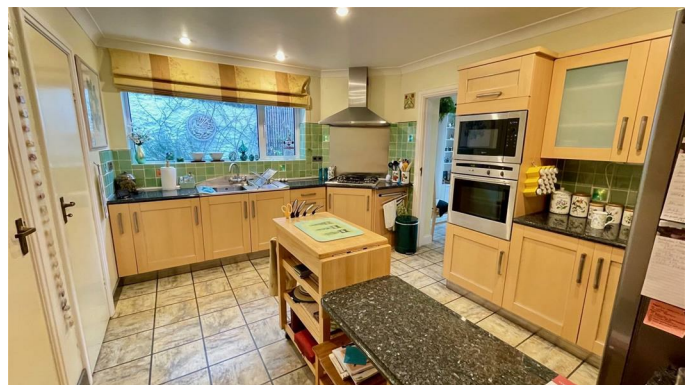
KITCHEN 14'2" x 10'10" (4.32m x 3.31m)

Picture rails, wood block flooring, upvc double glazed windows.