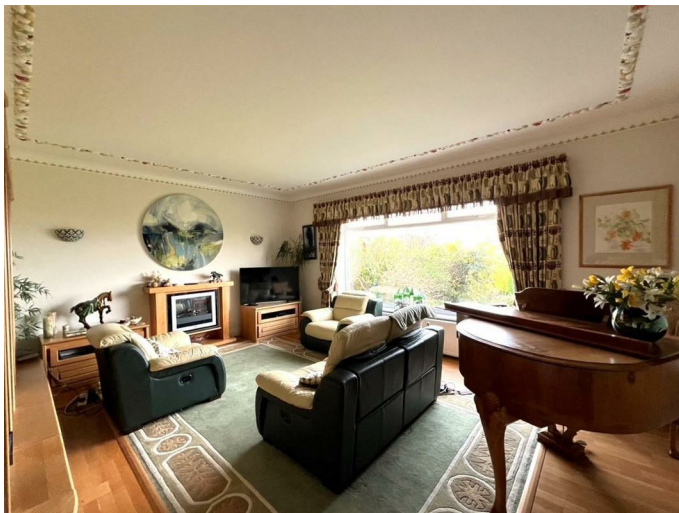
LOUNGE 18'4" x 14'5" (5.59m x 4.40m)

Tiled floor, upvc double glazed windows with door opening leading to patio seating area with open views.