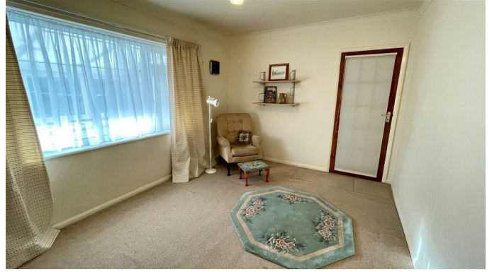
BEDROOM 2 12'10" x 9'10" (3.93m x 3.02m)

Double radiator, upvc double glazed window, radiator, access door to the kitchen.