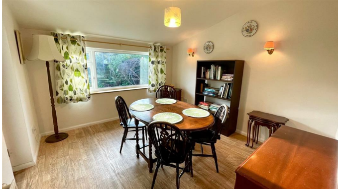
DINING AREA 11'6" x 10'7" (3.51m x 3.23m)

Double radiator, upvc double glazed window. Access to: