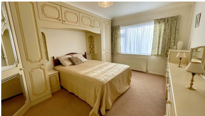
BEDROOM 1 14'10" x 10'11" (4.54m x 3.33m)

Including built in wardrobes, bedside cabinets, dressing table, double radiator, upvc double glazed window.