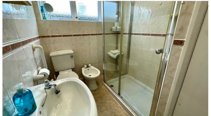
4 PIECE SHOWER ROOM

Comprising shower stall, wash hand basin, bidet and w.c., wall tiling, airing cupboard with radiator, double radiator, upvc double glazed window.