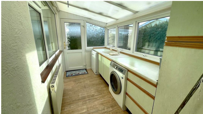
UTILITY ROOM 11'2" x 5'10" (3.42m x 1.78m)

Base unit, plumbing for automatic washing machine and dishwasher, sink, radiator, upvc double glazed window.