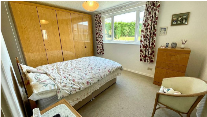
BEDROOM 1 13'11" x 9'11" (4.25m x 3.04m)

Coved ceiling, upvc double glazed window, double radiator.