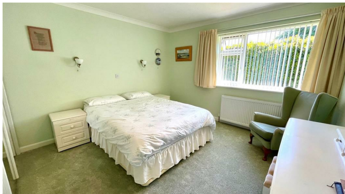
BEDROOM 1 13'5" x 11'10" (4.11m x 3.62m)