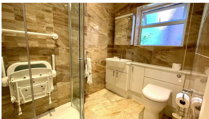
TILED MODERN 3 PIECE SHOWER ROOM IN WHITE

Shower and rain shower, vanity wash hand basin, low flush wc, ladder style towel warmer, upvc double glazed window.