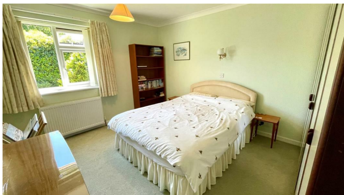
BEDROOM 2 12'10" x 10'10" (3.92m x 3.32m)