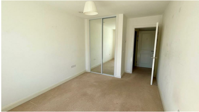
BEDROOM 1 14'4" x 9'6" (including wardrobes) (4.38m x 2.90m (including wardrobes))

Built in mirrored door, wardrobes, limited sea view.