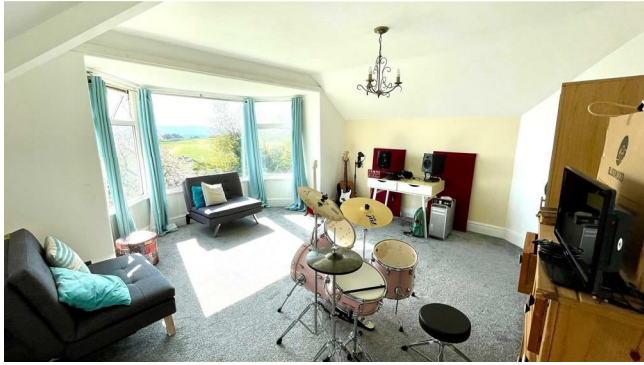
BEDROOM 1 16'5" x 15'1" (5.02m x 4.61m)