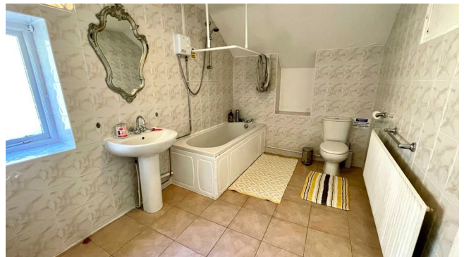
FULLY TILED BATHROOM

Side panelled bath with electric shower over, pedestal wash hand basin and w.c., radiator, shelved storage cupboard.