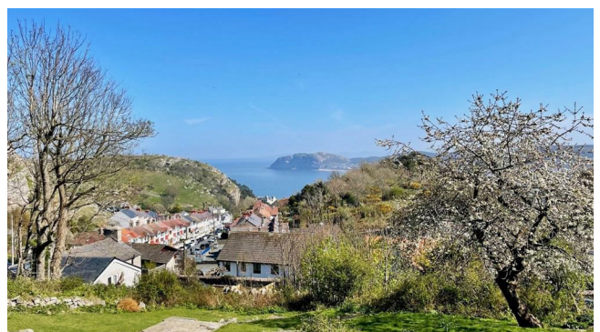
VIEW FROM GARDEN

Side panelled bath with electric shower over, pedestal wash hand basin and w.c., radiator, shelved storage cupboard.