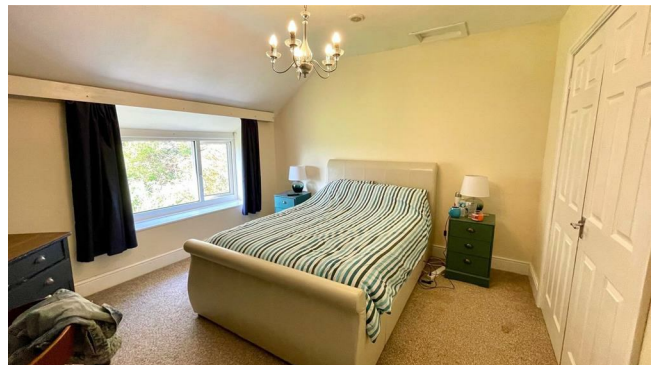
BEDROOM 3 11'6" x 12'1" maximum (3.53m x 3.70m maximum)

Wardrobe/storage, radiator, small loft hatch access.