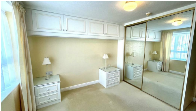
BEDROOM 2 14'2" x 9'10" (4.34m x 3.01m)

Built in wardrobes with sliding mirror doors, top cupboards, upvc double glazed window.