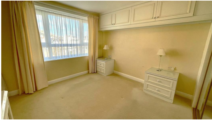
BEDROOM 1 12'0" x 10'0" (3.67m x 3.05m)

Built in wardrobes with sliding mirror doors, top cupboards, upvc double glazed window.