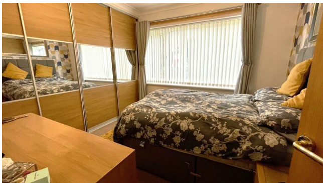
GROUND FLOOR BEDROOM 2 10'2" x 10'0" (3.11m x 3.06m)

Plus full width fitted wardrobes with mirror fronted sliding doors, hanging rail and shelving, coving, upvc double glazed windows, radiator.