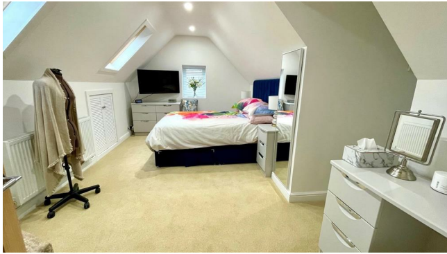
BEDROOM 1 16'4" x 10'1" max overall (5.00m x 3.08m max overall)