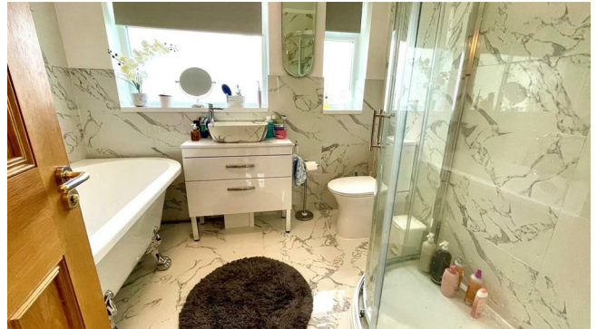
GROUND FLOOR 4 PIECE BATHROOM IN WHITE 8'3" x 6'11" (2.54m x 2.13m)

Comprises freestanding bath with claw feet, mixer tap, close coupled w.c, corner shower stall with mains shower, towel rail/ radiator, spotlights, marble effect porcelain wall and floor tiles, 2 upvc double glazed windows.