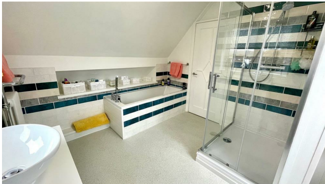
EN-SUITE 4 PIECE BATHROOM IN WHITE 11'3" x 9'5" (3.44m x 2.89m)

Tiled bath with mixer tap and shower attachment and recessed display shelving, double shower stall with mains shower and twin shower heads including drench shower, vanity wash hand basin and mixer tap, close coupled wc, radiator, towel rail, extractor, shelving, 'Velux' double glazed skylight window and upvc double glazed window, decorative wall tiling and vinyl flooring.