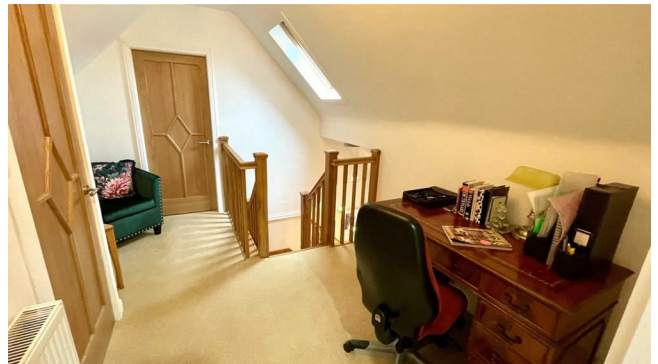
FIRST FLOOR LANDING/ STUDY AREA

'Velux' double glazed skylight window, double radiator, cupboard housing gas fired 'I-mini2' combination central heating and hot water boiler.