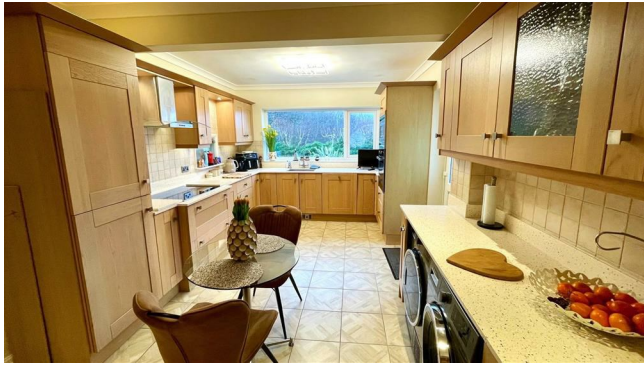
KITCHEN/ BREAKFAST ROOM 16'9" x 10'6" (5.13m x 3.21m)