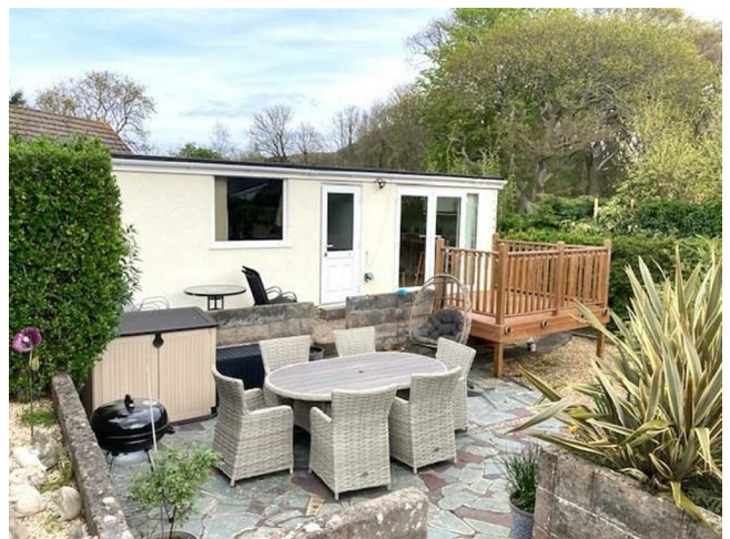
GARAGE 27'9" x 8'8" overall (8.48m x 2.66m overall )

Including modern 2 piece washroom comprising wash hand basin and w.c. and office/garden room with, up and over door, upvc double glazed side door, double opening upvc double glazed patio doors to raised decked area.