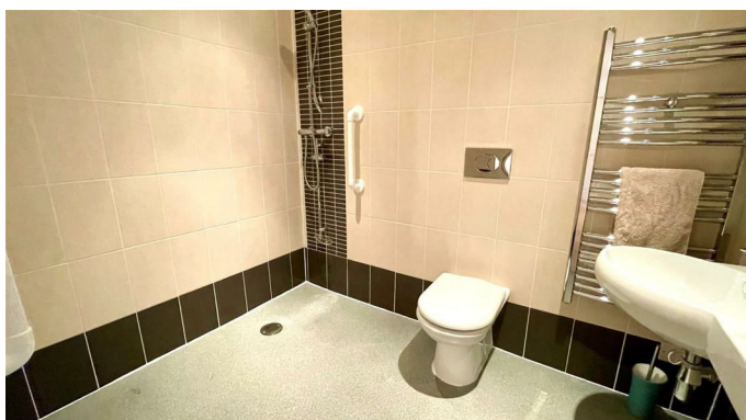
FULLY TILED WET ROOM 7'9" x 5'7" (2.38m x 1.71m)

Walk-in shower facility, pedestal wash hand basin and