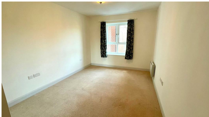
PRINCIPAL BEDROOM 14'11" x 9'5" (4.56m x 2.88m)

low flush w.c., ladder style radiator, mirrored cabinet, downlighters, extractor fan.