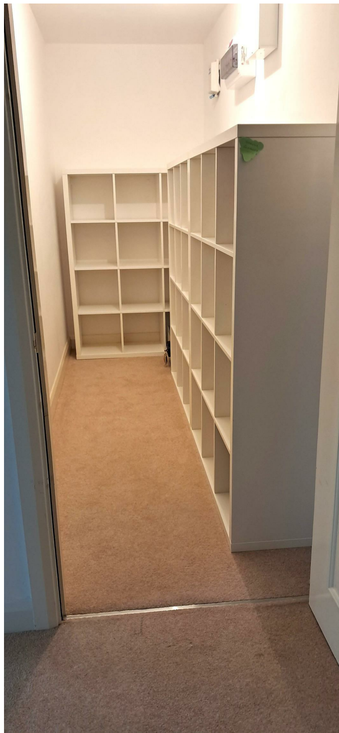
LARGE STORAGE ROOM 11'1" x 3'11" (3.4m x 1.2m)

low flush w.c., ladder style radiator, mirrored cabinet, downlighters, extractor fan.