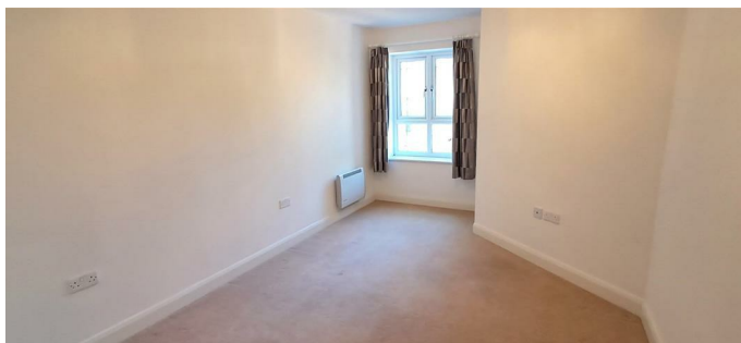
BEDROOM 2 MAX 14'10" x 9'8" (4.54m x 2.96m)

Second bedroom/ dining room/study with thermostatically controlled electric wall heater.