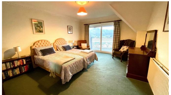
BEDROOM 2 17'0" x 12'9" (5.20m x 3.91m)

Double shower stall with decorative tiling, 'Mira' electric shower, pedestal wash hand basin and close coupled w.c, shaver light, extractor Velux double glazed skylight window, recessed spotlight, double radiator.