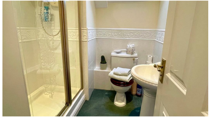
EN-SUITE 3 PIECE SHOWER ROOM

Double shower stall with decorative tiling, 'Mira' electric shower, pedestal wash hand basin and close coupled w.c, shaver light, extractor Velux double glazed skylight window, recessed spotlight, double radiator.