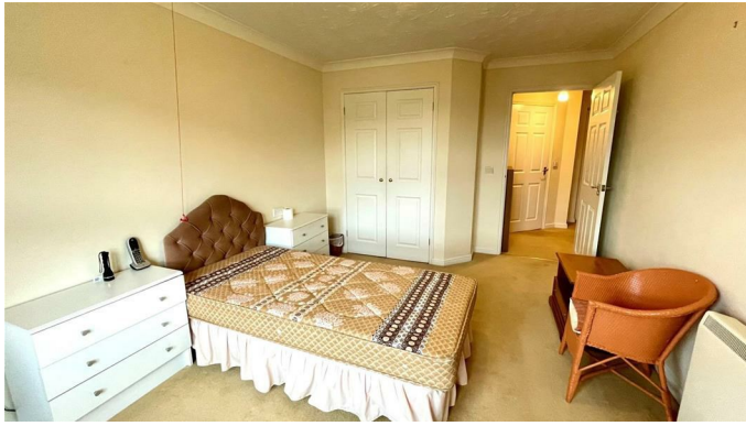
BEDROOM 2 17'7" x 10'4" (5.36m x 3.16m)