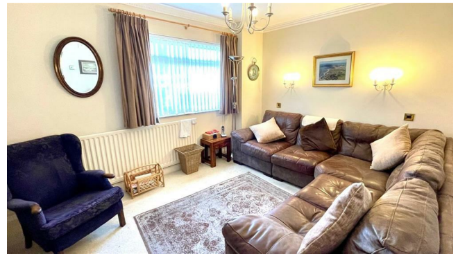
BEDROOM 3 14'4" x 9'10" (4.39m x 3.02m)

Decorative coving, glazed window, display shelving, radiator.