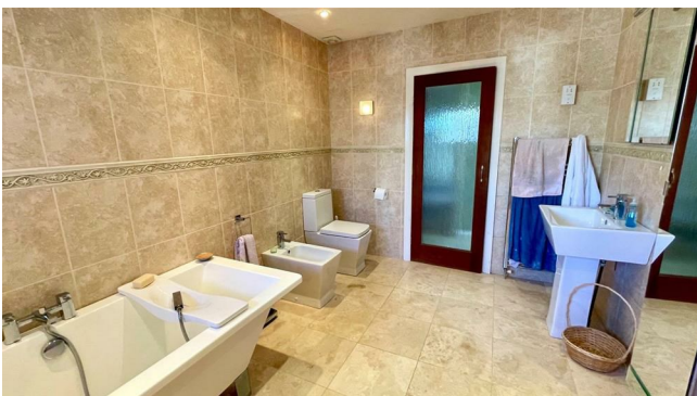
TILED 4-PIECE BATHROOM

Decorative coving, glazed window, display shelving, radiator.