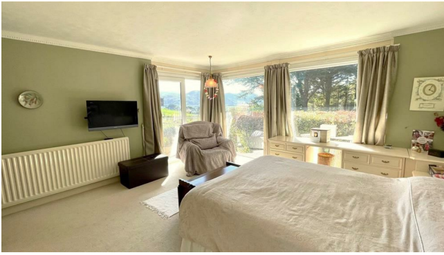
BEDROOM 2 12'6" x 11'11" (3.83m x 3.65m )